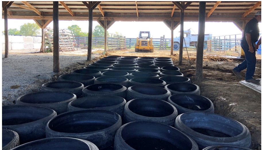
Figure 3. Mechanical Concrete® is a process by which tread cylinders are used to contain the rock and control lateral stress.