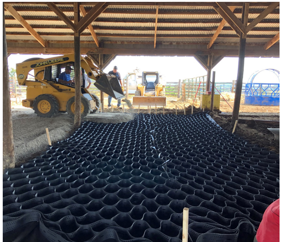
Figure 1. A four-inch geocell product was installed to create pervious flooring.

A 4 ft by 150 ft roll of plastic grid with a geotextile backing was used to create this treatment. A base layer of filter fabric, topped with six inches of DGA was placed and leveled within two inches of the final grade. Four strips of a two-inch layer of interlocking plastic grid, with a filter fabric backing, was placed on the rock, connected, and then backfilled with