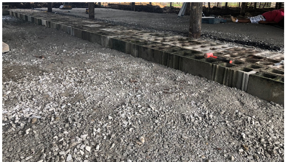
Figure 4. Cinder-block flooring treatment being placed.