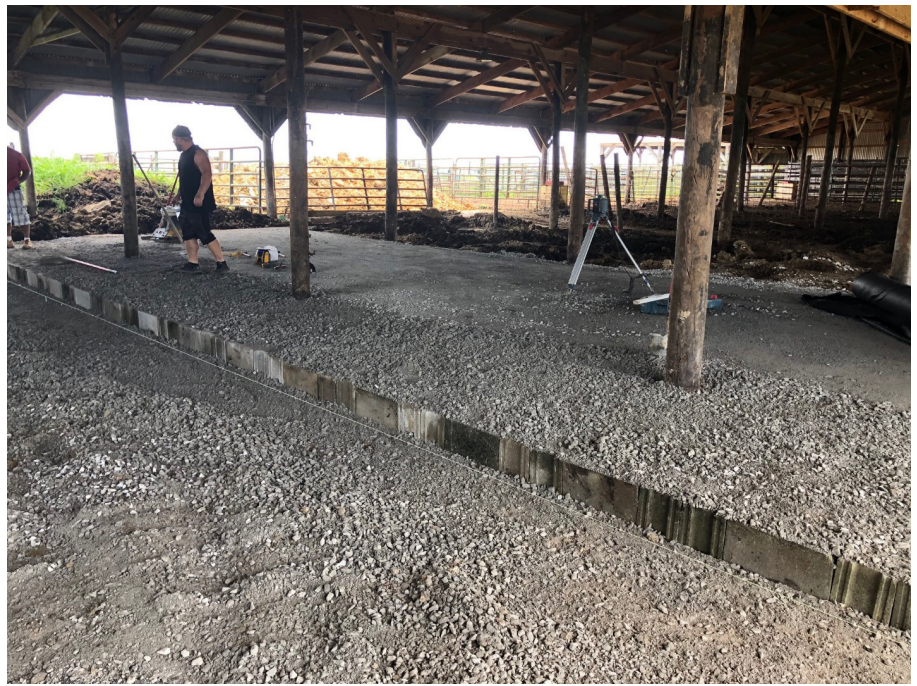
Figure 5. Backfilling and plate compacting DGA into cinder block voids.

This case study demonstrated four floor designs for housing cattle that meet the animals' needs while facilitating manure removal, storage and handling. All of the treatments—four-inch geocell, plastic grid, Mechanical Concrete®, and concrete cinder blocks—would last longer than a fabric and rock pad. However, the concrete block flooring showed significant dampness and, because of the weight of the blocks, was hard to manage and labor intensive. Both the geocell and plastic grid were more expensive initially than other options but drained well, which would reduce bedding costs over time. Mechanical Concrete® was the easiest to install and was very cost-effective considering the additional years it could add to a fabric and rock underlayment.