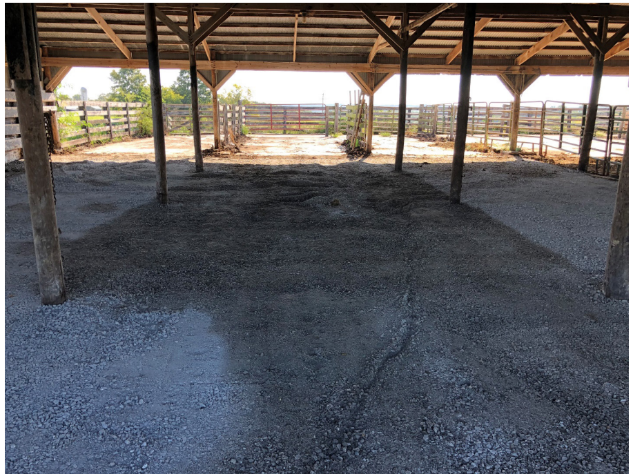
Figure 6. Moisture present in the cinder-block flooring treatment.