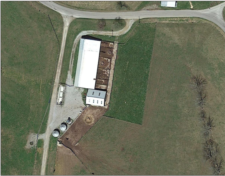
Figure 4. A buffer has been installed below this open concrete pad (the area on the right) to increase infiltration while at the same time filtering, absorbing, utilizing, and treating runoff.

for convenience. The systematic incorporation of feedstuffs, bedding, and manure can provide a much more efficient operation, especially where self-feeding is included in the design.