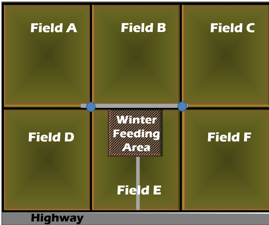
Figure 2. Layout of a centralized operation, with a lane and two watering locations at the intersection of six fields.