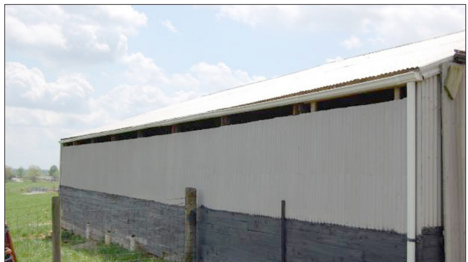
Figure 5. The backside of the structure after sheet metal was removed to improve airflow.