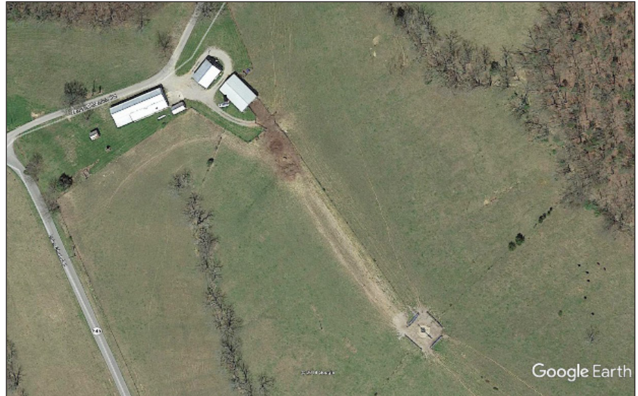
Figure 8. An aerial view of the heifer barn complex with its four-way waterer.

Figure 8 is a current aerial view of the project area. Comparing this image with the images in figures 1 and 2, respectively, demonstrates the repositioned waterer in relation to the heifer barn and rotating pastures.