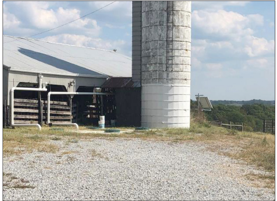
Figure 6. The water harvesting system consists of collection, conveyance, storage, distribution, and power. Downspouts from the entire roof discharge into two 2,000 gallon cisterns. The storage area and maximum height of the water in the silo is represented by the painted area.

Land- and water-use planning considers spatial parameters that include access, location, shape, and dimensions. Figure 7 shows a diagram of the watering station that was installed on the Eden