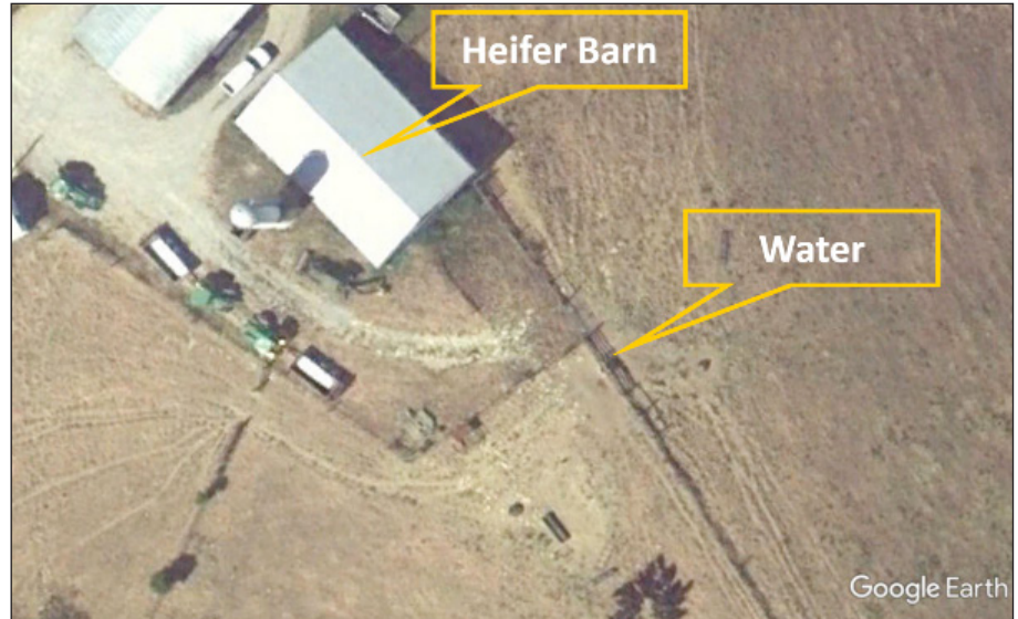
Figure 1. Old Sheep Barn on the Eden Shale Farm in Owen County, Ky. There are adjacent pastures just beyond the edges of this picture.

A demonstration of land- and water-use planning is this example from a working farm. The Eden Shale Farm, in Owen County, Ky., has an old structure that was once used as the sheep barn.