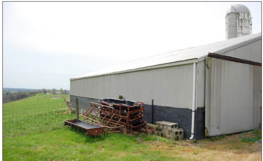
Figure 4. The backside of the structure before removing sheet metal to improve ventilation.