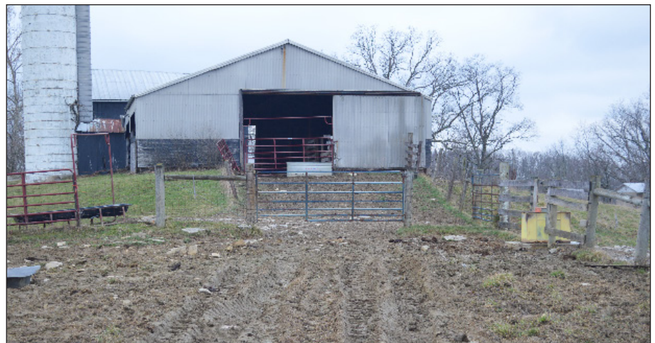
Figure 2. Entrance ramp and automatic watering fountain before renovating the southern end of the structure.

(Figure 1). An abandoned silo bisects the open, southwestern side of the structure. Animals get into the structure by ascending a slope at its southern end. Several pastures and a city-fed water fountain (figures 1 and 2) are adjacent to the structure. Many pastures are in a rotational grazing schedule, which incorporates these four pastures. The structure is used to house feed or provide shade to groups of cattle