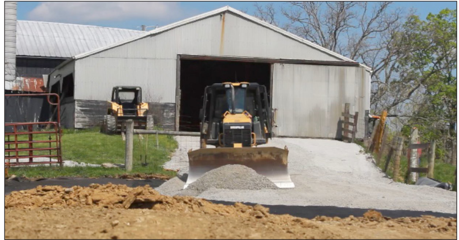
Figure 3. Heavy-use area being installed in the gateway into the pasture and ramp into the structure.

Drinking water was improved by creating a water-harvesting system with improved access to a watering station. Rainfall harvested from the roof provides the drinking water for stock, when they are in this area. The 40 by 60 structure captures approximately 1,500 gallons of rainwater with each inch of rainfall. To create the system, the downspouts from the southwest were routed into two 2,000 gallon cisterns, which were placed on the southwest side of the structure. The downspouts from the northeast side were routed through the structure to also drain into these cisterns (Figure 6). Water captured in the cisterns is pumped into the silo, which was sealed with hydraulic cement to store water. The total volume of the system is approximately 6,000 gallons. This volume matches the requirements for 30 cow-calf pairs, or approximately 5,300 gallons, with a buffer of 700 gallons. Assuming Kentucky averages four inches of precipitation per month, the system