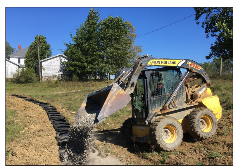
Figure 5. The tread cylinders are filled with rock.

The effort required to install an all-weather surface trail for grazing animals will not be wasted. Grazing animals and their offspring can be seen using these trails during all times of the year (Figure 7). These trails provide energy efficiencies for animals, particularly during wet weather periods.