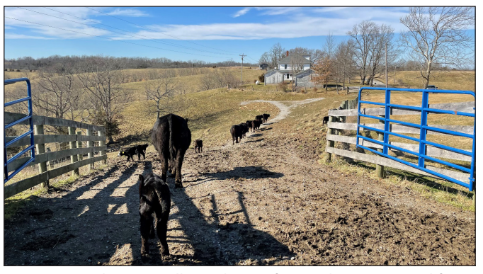
Figure 7. Cattle use an all-weather surface path to get to and from a water source.