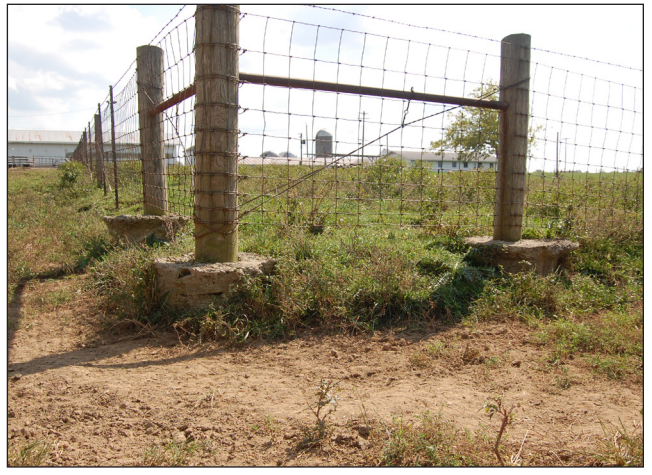
Figure 2. Livestock commonly create paths around obstacles in a field, such as internal corner posts.