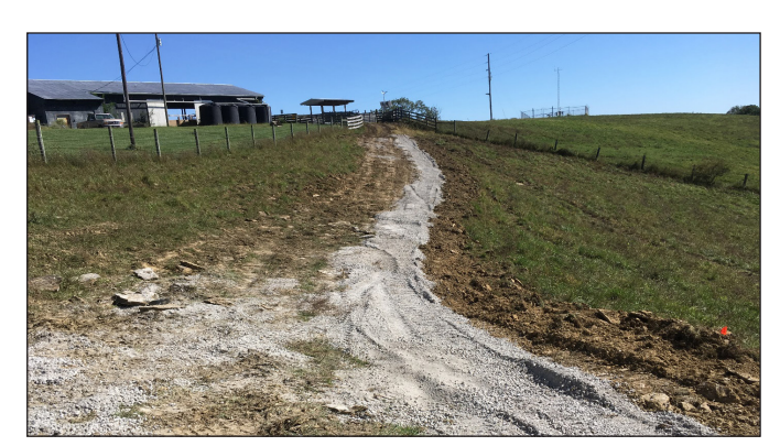
Figure 6. A completed trail leads to a water source located on a hill with 30-percent slopes.