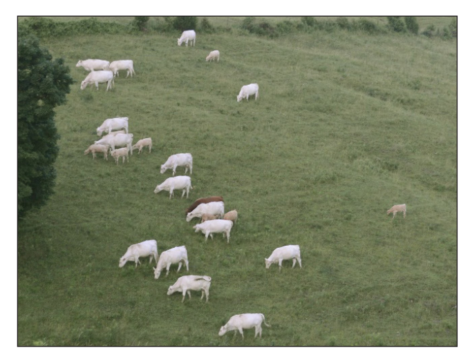
Figure 1. One animal typically occupies a grazing trail. These trails allow the animals to graze the upper slope and provide grazing and energy efficiency.

An actual tire cylinder may be approximately 40 inches in diameter, but the removal of the tire sidewall will enable the tire cylinder to fit within a 36-inch-wide trench. Nonwoven geotextile fabric should be placed in the bottom of the trench (Figure 4). This material is needed to provide the drainage, reinforcement, friction, and separation necessary for structural integrity. The tread cylinders are then placed end to end, on top of the geotextile fabric (Figure 4). A suitable rock material, such as dense-grade aggregate (DGA), is then placed inside and around the tire voids (Figure 5). The top edge of the tire cylinder should be at grade level or a little higher (Figure 6).