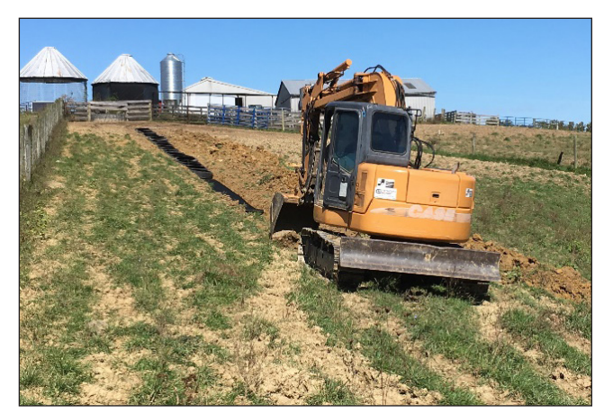
Figure 3. A backhoe creates a trench for the all-weather path.