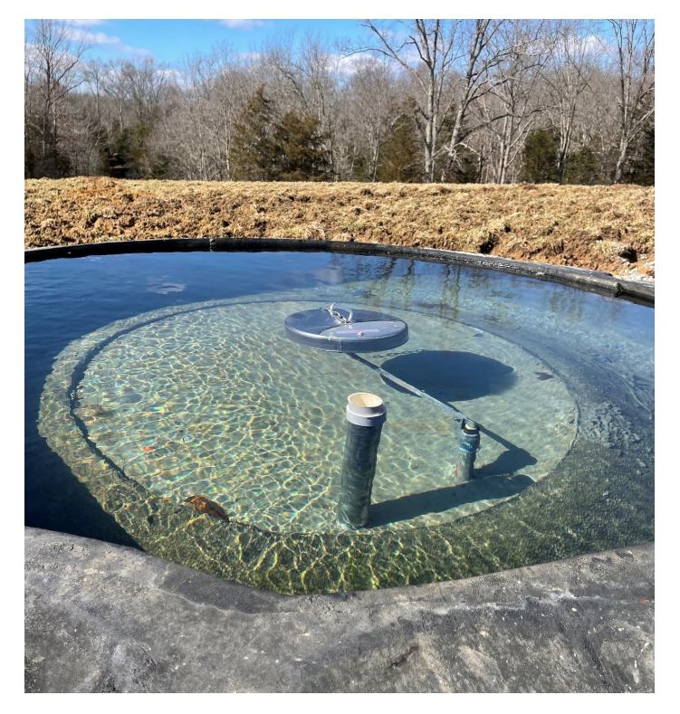
Figure 1. An open trough allows a producer to easily inspect the visual condition of livestock drinking water.

A livestock producer's goal should be to acquire the best water obtainable for livestock. However, once acquired, the quality of the water may change due to contamination, seasonal influence, or other factors. The placement of a winter-feeding area above a watershed of a pond or lake, for example, could negatively affect the water quality. Runoff from municipal areas, flooding, and failing septic systems are other possible causes of degraded water quality. Livestock producers can alter and improve water sources. Producers interested in determining the adequacy of a water source should follow multiple steps to test it.