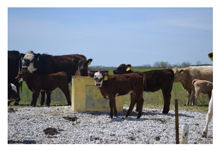
Figure 6. Calves in this lot are transitioning from their mother's teat to drinking water. Due to the height of the waterer, the calves cannot reach the water easily.