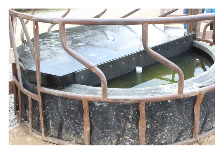
Figure 5. The probability of freezing in winter can be lowered by reducing the surface area of troughs. This cover can also be positioned on a trough to change air flows and lower the probability of the water freezing.