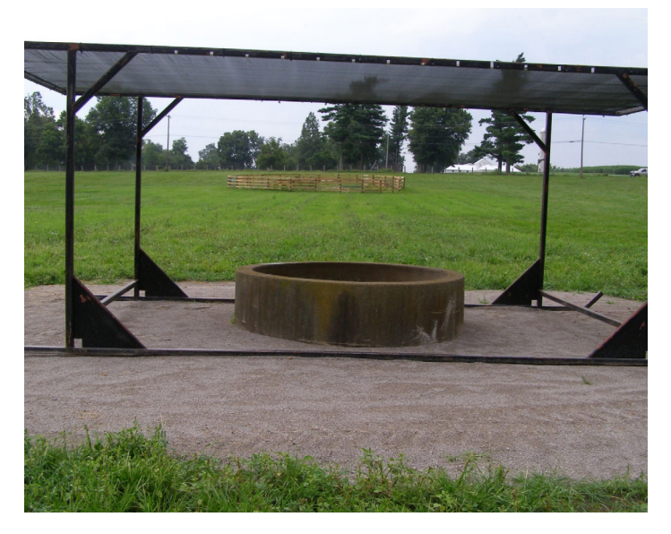
Figure 4. A shade structure has been placed over this water trough to reduce sunlight and algae production.