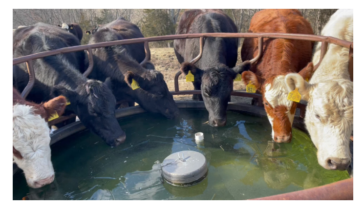
Figure 2. A tire waterer is an example of a trough that allows multiple animals to drink simultaneously. A trough of this size is ideal for splitting between two pastures or for making a watering hub for multiple pastures.

cattle herd size of 20 should provide, at a minimum , four feet of perimeter at a water trough to allow two animals, or 10 percent of the herd, to drink simultaneously.