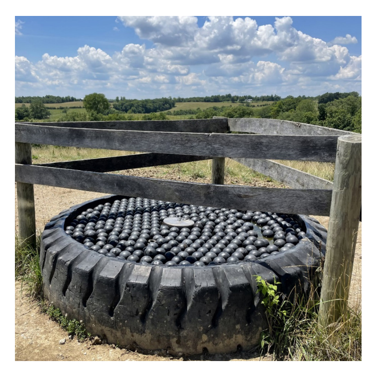
Figure 3. Shade can be used to keep the water cooler and reduce algae blooms, and it may increase water consumption. In this image, shade balls have been installed to reduce temperature, algae production, and evaporation.

Shade balls and covers are examples of management practices for reducing the heat load on water sources (Figure 3). Shade structures placed over a water trough can also reduce heat load and algae formations (Figure 4).