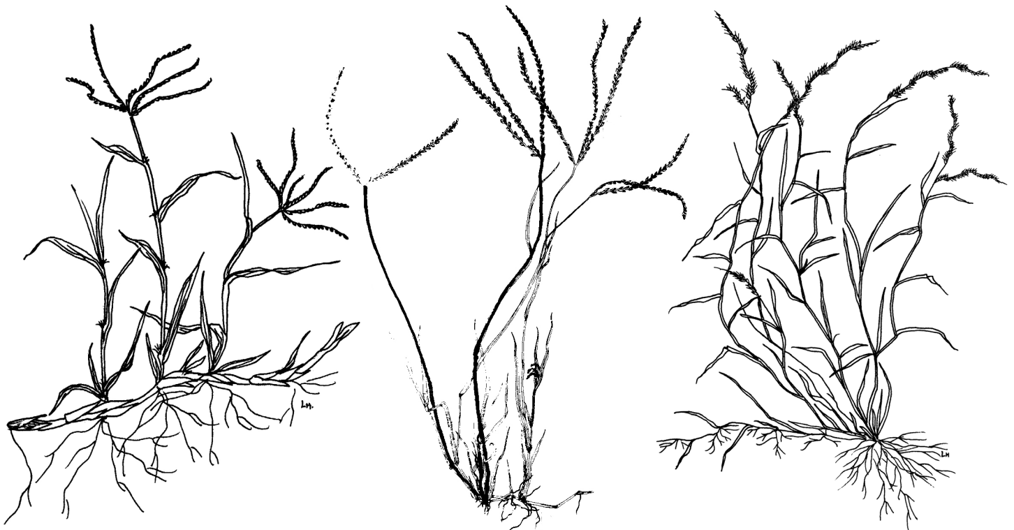
Figure 8.1. Examples of monocots: bermudagrass ( Cynodon dactylon ), crabgrass ( Digitaria spp.), and nimblewill ( Muhlenbergia schreberi J.F. Gmel.).

Once you know a plant, you can gather important details about its life cycle and how it spreads within the landscape or garden. With practice, you can learn to distinguish weed seedlings from your planted vegetables and flowers.