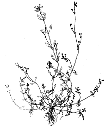
Figure 8.3. Common chickweed, an example of an annual weed.