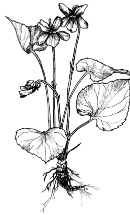
Figure 8.2. Wild violet ( Viola sp.), an example of a dicot.

Note: This list is not exhaustive, but it does include many of the most common weeds that gardeners should recognize.