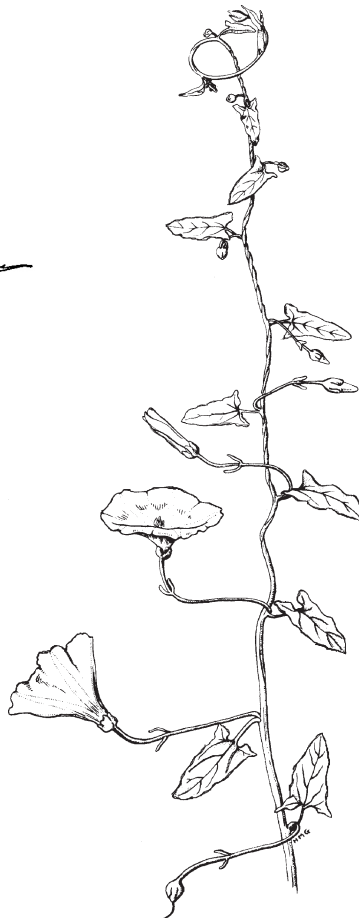
Figure 8.5. Field bindweed ( Convolvulus arvensis ), an example of a perennial weed.