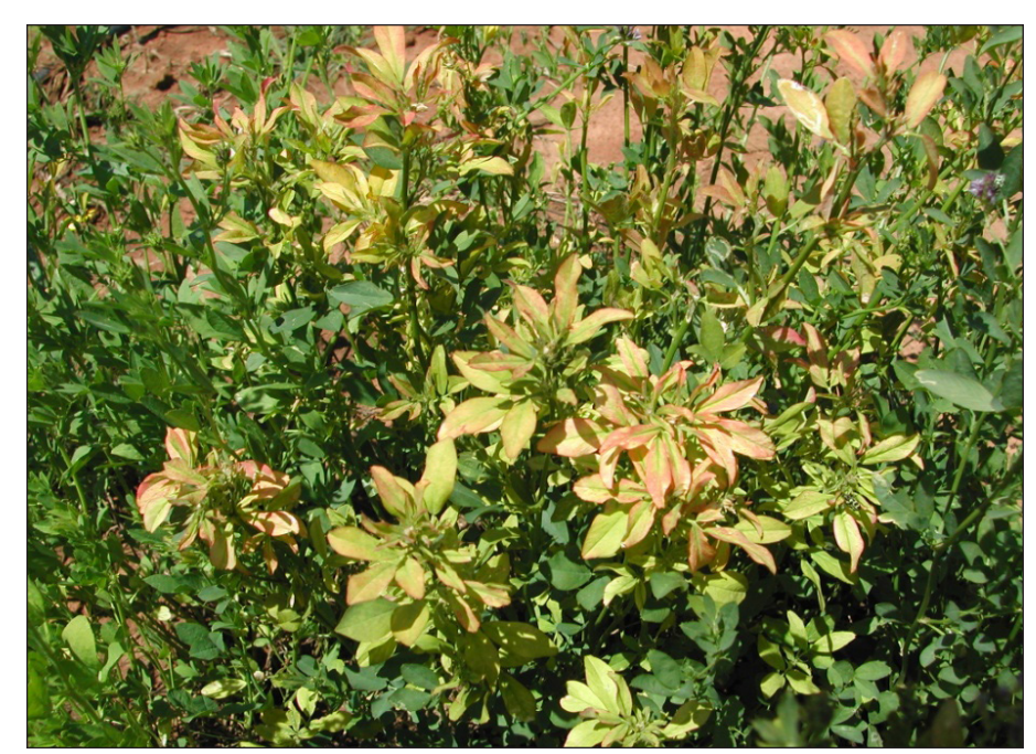
Figure 3. Boron deficiency symptoms in alfalfa.

Luxury consumption of potassium by forage crops is a phenomenon that should be understood by all forage producers. Simply put, luxury consumption refers to the plant uptake of K in excess of the plant needs. This can occur when a plant is supplied with more than adequate amounts of K. When an alfalfa plant is adequately fertilized, the K concentration in the tissue is usually between 2.0 and 3.5 percent. If the soil supply of K exceeds the needs of the crop, tissue K concentrations can be as high as 4.5 percent. For grain crops such as corn or wheat, luxury consumption is not a problem, because excessive K uptake remains in the plant tissue (leaves and stalk) and is returned to the soil with the fodder. For alfalfa and other crops where the entire plant is harvested, excessive K uptake is removed as hay or silage and is not recycled in the soil. Luxury consumption can increase K removal rates to 90 lb K<sub>2</sub>O per ton (55 lb K<sub>2</sub>O per ton is normal removal). The main drawback to luxury consumption of K is that fertilizer applied to increase soil test K can be immediately removed with the first harvest, resulting in lower than optimum soil test K levels for subsequent harvest.