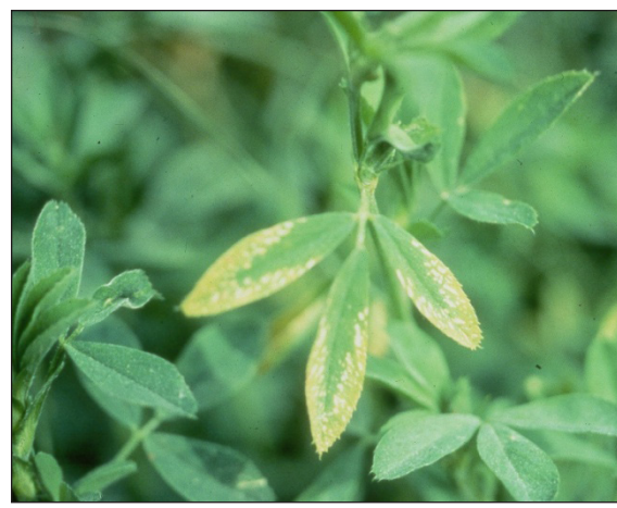
Figure 2. Potassium deficiency symptoms in alfalfa.

level is between 300 and 450 lb per acre and 4 tons of hay are harvested, then 220 lb of K<sub>2</sub>O would be added to replace the amount removed in the harvested hay.