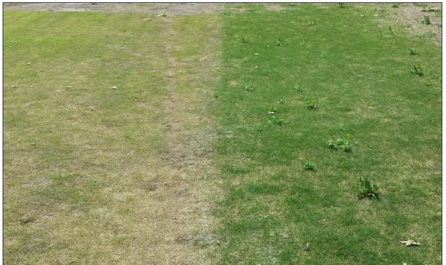
Figure 12. Bermudagrass spring greenup differences between a lightweight cover (left) and a turf blanket (right). Turf blankets offer superior protection from winter temperatures but are very heavy and rather awkward to place and remove.