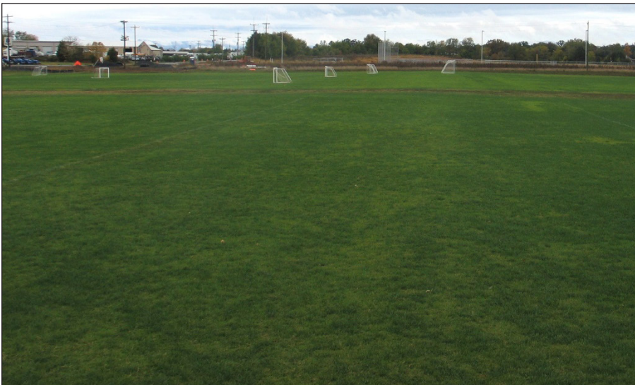
Figure 5. Portable goals extend the life of a field and are ideal for practice and warmup drills.