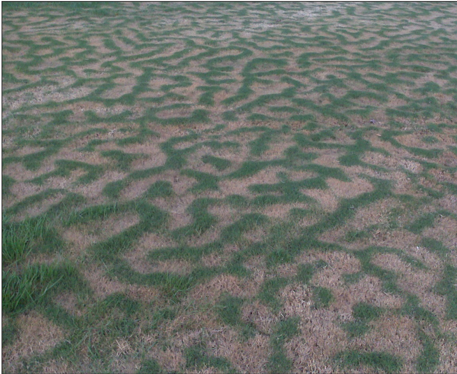
Figure 3. Uneven growth causes slight differences in canopy heights. The initial frost of the fall collects in lower areas causing a loss of color while leaving the taller leaves untouched. This spectacle is commonly referred to as “leopard spotting.”

dormancy period. During active growth (May to early September), bermudagrass will require mowing two to three times per week, especially if it is maintained at heights of 0.5 to 1 inch. Mowing less than 1 inch will require a reel-type mower to achieve the highest quality of cut, appearance, and smooth-surface playing characteristics. Again, be careful when selecting a bermudagrass cultivar in terms of the ability and budget to provide the level of maintenance intensity it will require. Far too often, more money is spent on the maintenance of a reel mower than on the actual maintenance of the bermudagrass field. If a reel mower is not financially appropriate for your situation and maintenance capabilities, a rotary mower equipped with sharp blades and driven at the proper operating speed can provide an acceptable quality of cut. Rotary mowers, however, likely cannot duplicate the close cutting heights and mowing quality delivered by a properly adjusted and operated reel mower.