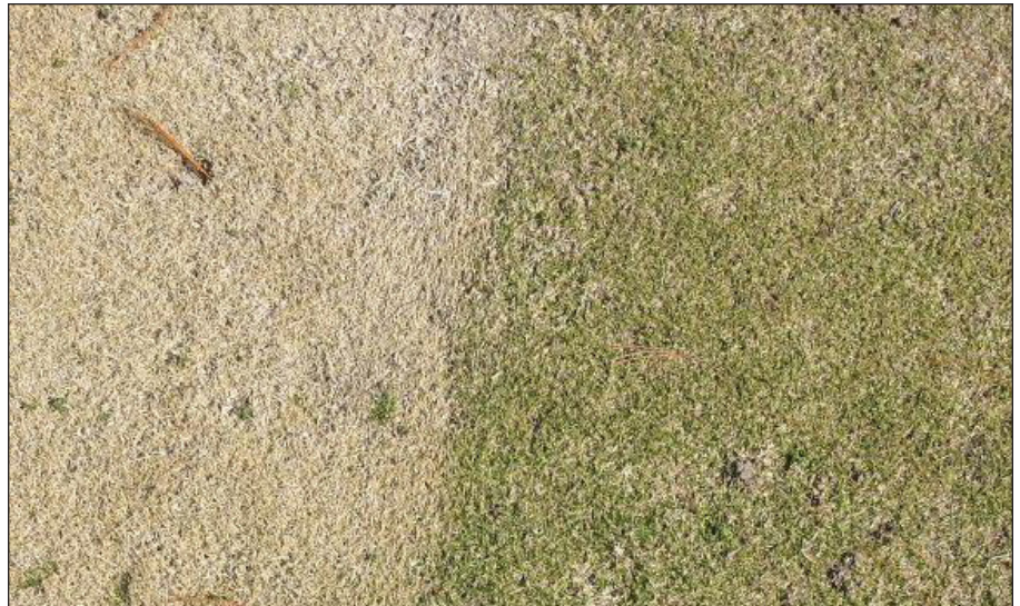
Figure 11. Covered (right) versus uncovered (left) bermudagrass in late winter. Covers protect warm-season grasses from extreme cold and reduce the length of dormancy.