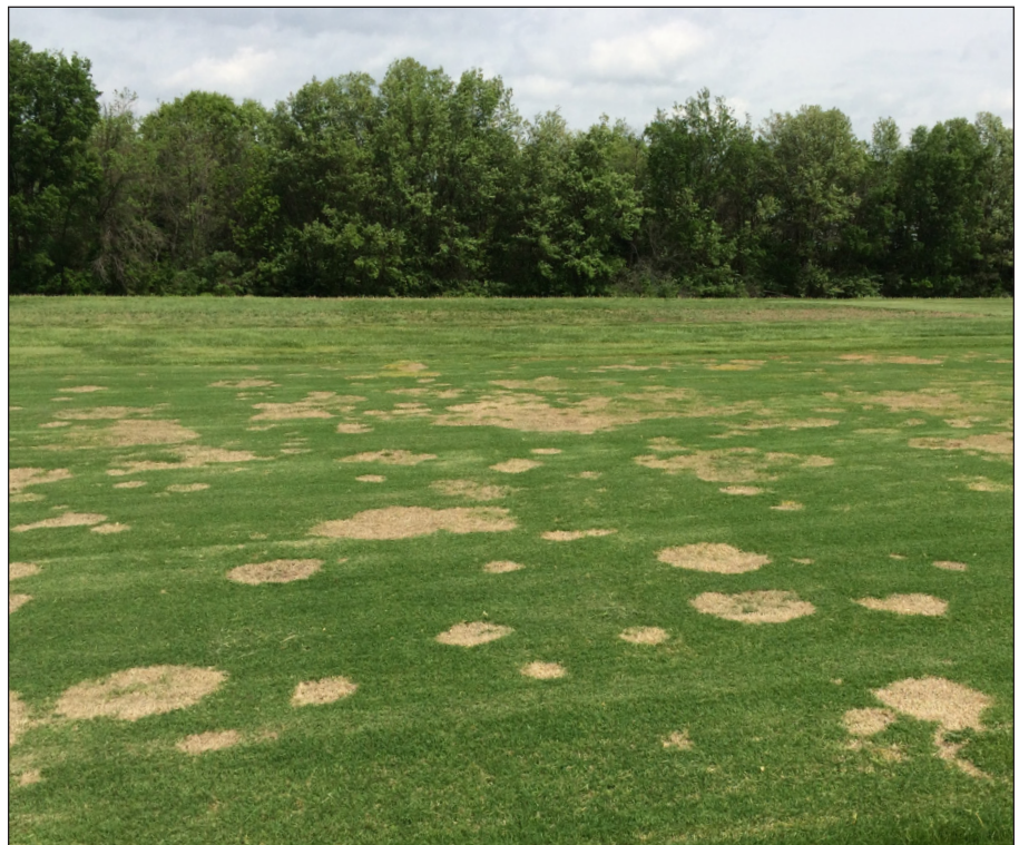
Figure 18. Spring dead spot disease of bermudagrass in Missouri. Although colonization from this fungal pathogen occurs during the early autumn and winter during slow growth, damage is visible in spring when the bermudagrass fails to green-up in affected areas.

Spring dead spot (SDS). This disease is active throughout the year but causes damage during autumn and winter when bermudagrass is not growing. It is first noticed in early spring when