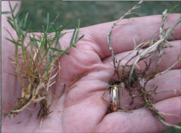
Figure 16. The dense turf of the playing surface in this late August picture of a Patriot bermudagrass field in Virginia is much more prone to scalping than the sideline area where the turf had previously been worn away. The difference is in the number of leaves on the stems as shown in the inset photo, sideline stem (L) and playing surface stem (R).