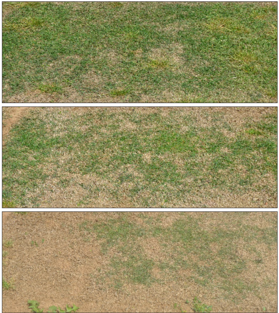
Figure 7. Spring green-up of bermudagrass in Kentucky following summer nitrogen application rates of 1 lb. N/1000 sq. ft./month (top), 2 lb. N/1,000 sq. ft./month (middle), and 4 lb. N/1,000 sq. ft./month (bottom). Nitrogen applications began in mid-July and ceased Sept. 1. Photo was taken in late-April of the following year.

Most turf managers are familiar with the suggestion of applying a “winterizer” fertilizer containing K to help grasses survive the winter. As the plant enters dormancy, K can increase in the cell sap acting as an “antifreeze” that helps prevent cell rupture and death during very cold weather. Research has shown that if the soil test level for K is adequate (36-60 ppm using the Mehlich-3 soil test), little if any benefit is gained by applying additional K during autumn. In fact, by overloading soil cation exchange sites with K + , the availability of other essential nutrient cations can be reduced, thus limiting uptake of the other necessary elements. The take-home point of this information is the importance of regular soil testing and making timely applications of any nutrients and/or lime that are recommended by the soil test results. Like N in some fertilizers, highly water-soluble K can leach out of the rootzone, especially on sandy soils or during wet