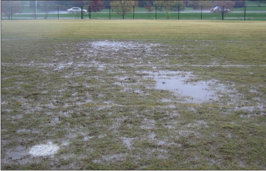
Figure 4. Do not traffic wet/saturated fields. These fields are prone to damage from soil displacement and divoting and increased soil compaction.