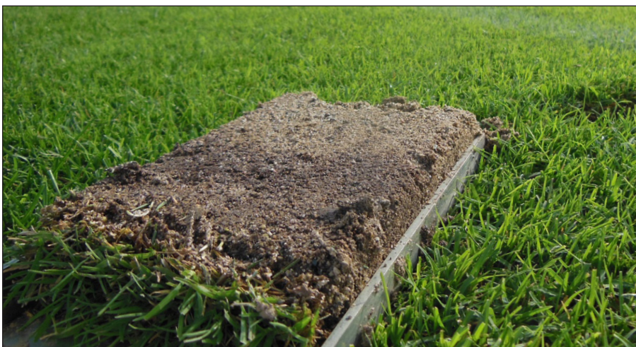
Figure 6. A highly modified, sand-based athletic field rootzone is designed to promote drainage.

Minimize use during dormancy. During slow growth and wet soil conditions do not allow practices or intense use on game fields (usually from September through May). Also, it is important to restrict incidental play by clubs or classes. It can be helpful to track field usage during the year to better estimate how much use a field can withstand.