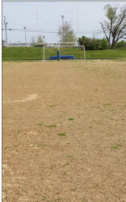
Figure 1. A bermudagrass football field in Kentucky damaged by low temperatures during winter. Healthy, non-damaged stolons are elastic and firm whereas winter-damaged stolons are typically not pliable and flaccid.

To ensure a persistent bermudagrass turf in the unpredictable weather associated with the transition zone, cultivar selection is critically important. Cold tolerance levels vary tremendously among cultivars and there are many that should only be used in locations south of the transition zone (Figure 2). Over the past 20 years, numerous cultivars have been commercialized and specifically bred for improved cold tolerance. There are also many older cultivars with much