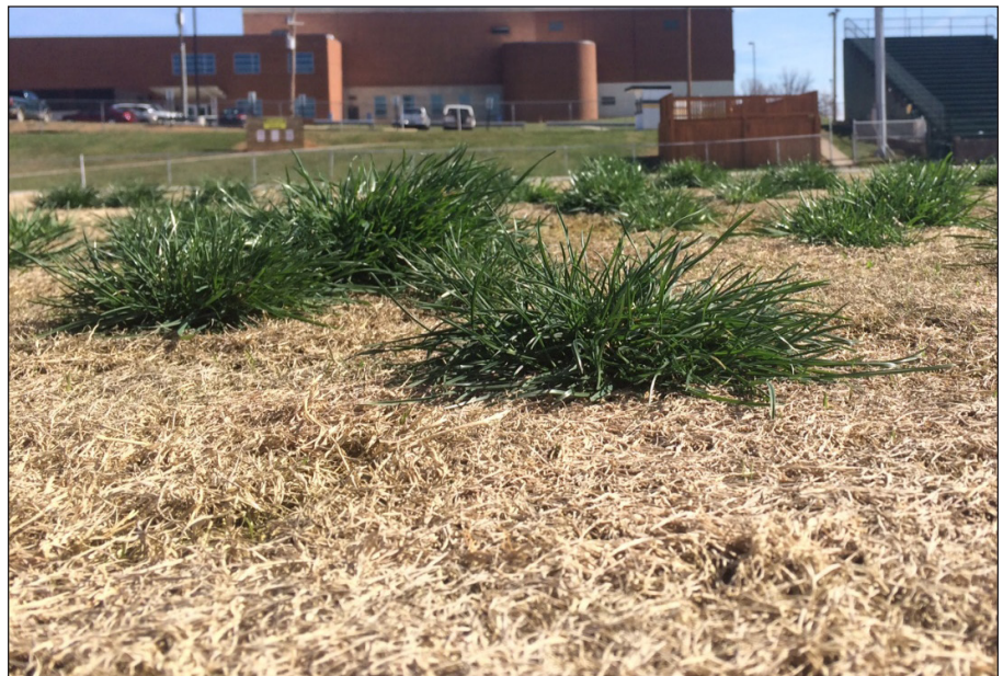
Figure 9. Clumpy ryegrass is both a safety and a playability hazard on dormant bermudagrass sports fields. The tall clumps create an uneven surface that negatively affect smooth ball roll and athlete footing.

Poor establishment and/or insufficient ryegrass seeding rates typically result in the loss of any enhancements related to insulation/traffic tolerance and may reduce field safety and playability due to ‘clumping’ of the low-density ryegrass plants (Figure 9).