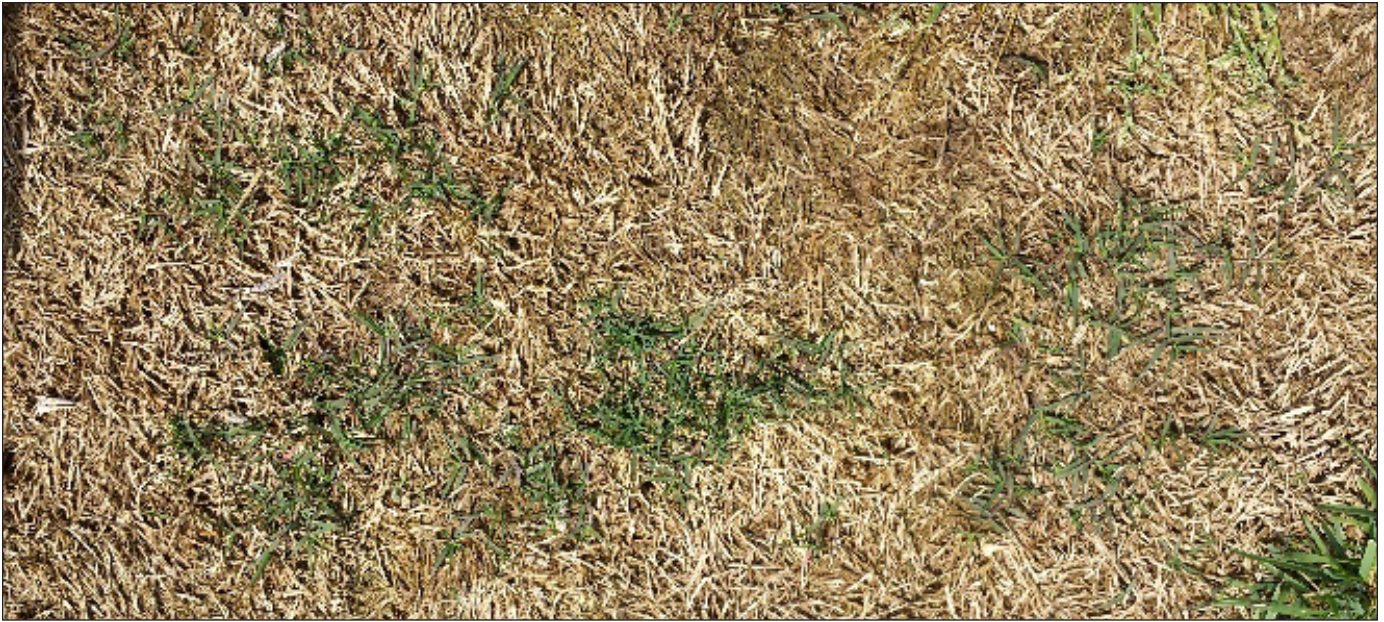
Figure 15. Bermudagrass damaged by winter temperatures should be able to recover as long as surviving plants are found within 1 square foot of other surviving plants.

increasing lateral growth, etc. These cultural practices are less disruptive to the surface but do little to relieve severe compaction. The severity of compaction