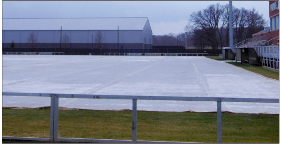
Figure 10. Turf blankets protecting a bermudagrass field in north-central Indiana. This type of cover is typically placed in late fall and removed in mid-spring.

Sideline covers are also frequently used to minimize wear on heavy wear areas like player's bench and cheerleader areas (Figure 14). These covers are only used during games and are removed to