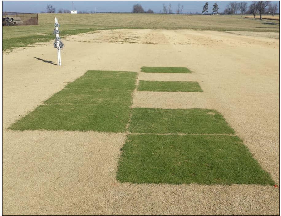
Figure 8. A bermudagrass winter-overseeding trial in Kentucky. Note that the cool-season grass (in this case perennial ryegrass) is green and growing (and able to recover) from traffic/wear while the non-overseeded bermudagrass is brown, dormant, and unable to recover.

While overseeding in general is considered to be detrimental to bermudagrass health due to the competition with bermudagrass each spring, if done properly, it can improve playability for late winter/early spring sports. If overseeding is to be done, it is important to establish a dense ryegrass canopy to ensure that playability and footing are optimized. For the transition zone, a typical overseeding rate is 200-400 lb. of pure live seed per acre (5-10 lb. per 1,000 sq. ft.).