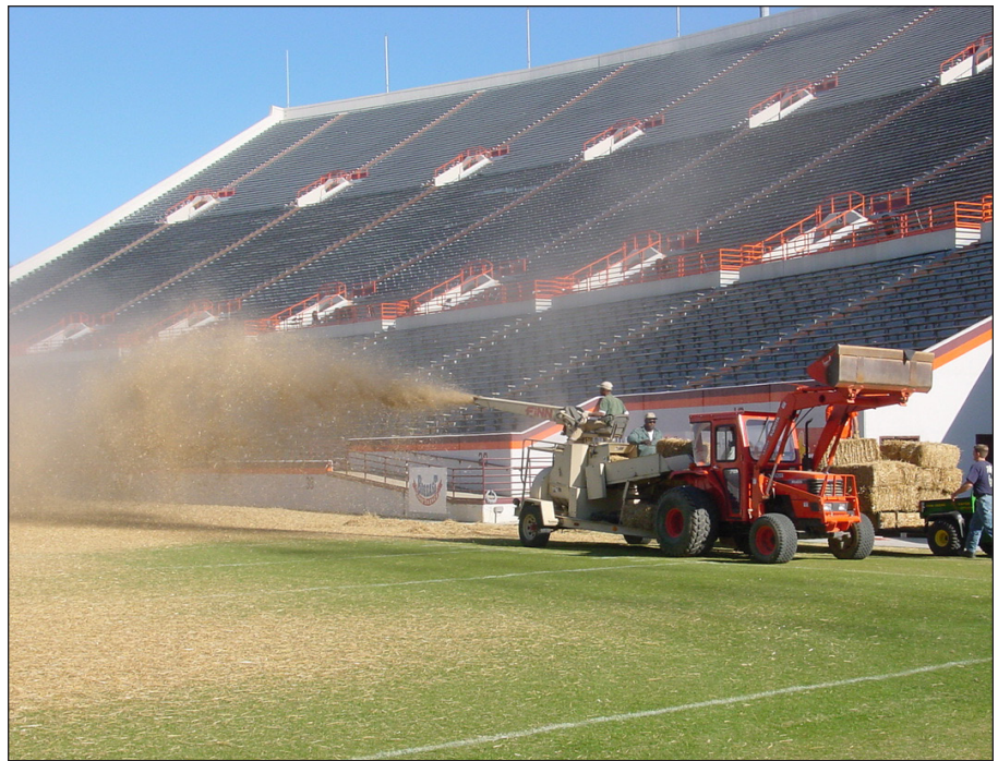
Figure 13. Straw being blown onto a bermudagrass football field in Virginia. Although straw is an excellent protectant from harsh temperatures, cleanup and other concerns exist when using straw.

It has been emphasized repeatedly in this publication that a healthy bermudagrass turf is much more likely to survive an extreme winter. The optimum growing season for bermudagrass is summer. During this time bermudagrass turfs should be as healthy as possible. Proper agronomic practices such as reasonable mowing heights (e.g. not too short or tall), maximizing nutritional inputs and supplemental irrigation as needed to prevent severe drought stress are essential. Summer is also the ideal time to improve any problem areas that restrict turf growth and vigor like soil compaction, poor drainage, and excessive thatch. Make every effort to begin the sporting season with 100 percent turf coverage. The following are factors that should be considered during the growing season: