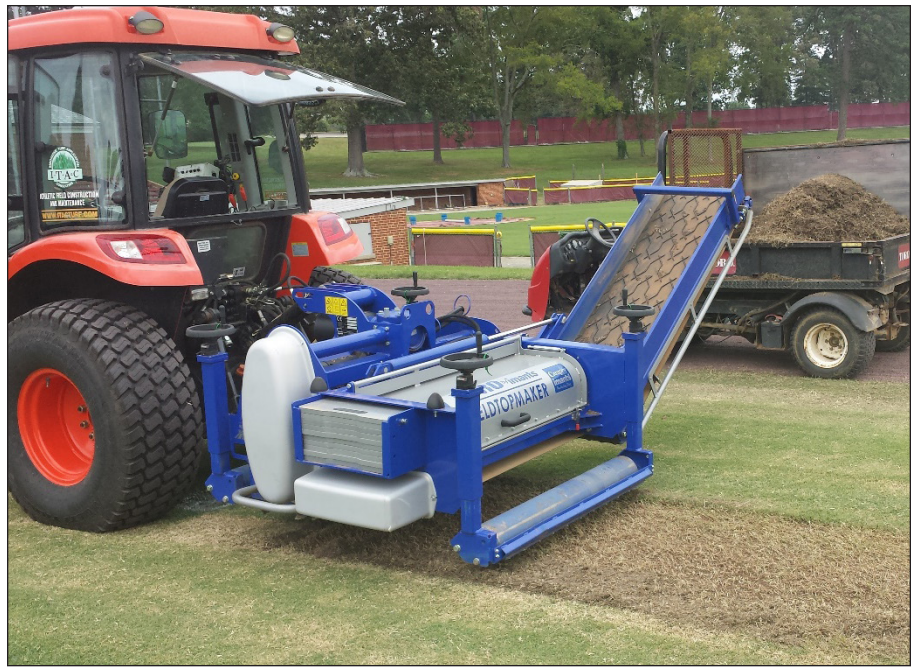
Figure 17. Fraze mowing is an excellent way to periodically rejuvenate extremely thick bermudagrass sports fields. It should be done only when there is ample time for grass recovery.

While it seems paradoxical, one of the best ways to promote bermudagrass shoot density is to thin the canopy, a process traditionally done with a vertical mower (e.g., dethatcher) once active growth resumes in the spring. Mechanical thinning should be followed by aggressive irrigation and nitrogen applications to promote plant growth. Some of the more recently released cold tolerant, high density cultivars are prone to scalping in late summer due to their density and a change in their growth habit in response to shorter day lengths and 'shading' of the lower leaves in the turf canopy (Figure 16). One of the newest strategies in rejuvenating bermudagrass fields is an extreme version of vertical mowing called fraze mowing (Figure 17).