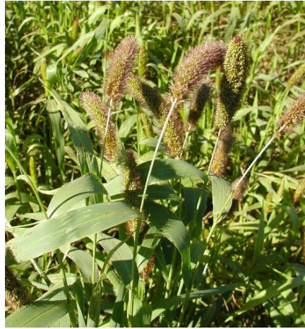
Figure 5. Foxtail millet head stage.

Foxtail millet (German millet) is fine stemmed, has no prussic acid potential and is well suited for hay-making (Figure 5). Susceptibility to sugarcane aphid is not known. It is the lowest yielding of the summer annual grasses since it will not regrow after cutting. It is a good smother crop to be used before no-till seeding another crop such as fescue or alfalfa. Foxtail millet is also used as a wildlife planting to produce food and cover for doves, quail, and other birds. For more information, see AGR-233: "Foxtail Millet."