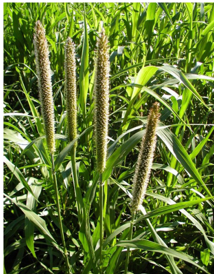
Figure 6. Pearl millet head stage.

Pearl millet is not related to foxtail millet and is higher yielding. It will regrow after harvest, does not have prussic acid potential and is not a host of the sugarcane aphid (Figure 6). Dwarf varieties are available which are leafier and better suited for grazing. Pearl millet is better adapted to more acid soils and soils with a lower water holding capacity than sorghum, sudangrass or sorghum-sudangrass hybrids. For more information, see AGR-231: "Pearl Millet."