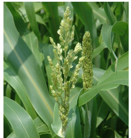
Figure 3. Sorghum-sudangrass head stage.

Sorghum-sudangrass hybrids are developed by crossing sorghum with true sudangrass (Figure 3). The result is a tall growing annual grass that resembles sudangrass, but has coarser stems, taller growth habit, and higher yields. Like sudangrass, hybrids will regrow after grazing if growth is not limited by environmental factors. The coarse stems are difficult to cure as dry hay, therefore these grasses are best utilized for grazing, chopped silage and baleage. For more information, see AGR-234: "Sudangrass and Sorghum-sudangrass Hybrids."