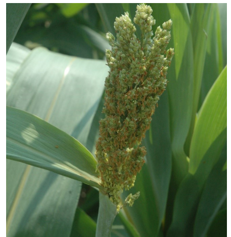
Figure 4. Forage sorghum head stage.

Forage sorghum can reach heights of 6 to 15 feet and is best harvested as silage (Figure 4). Taller varieties produce high forage yield but can lodge, making them difficult to harvest mechanically. Some varieties have been developed that are shorter with increased resistance to lodging. Like corn, forage sorghums are harvested once per season by direct chopping. While forage sorghum yields are similar to corn, they are lower in energy. The primary advantage of utilizing sorghum for silage production is its greater drought tolerance. For more information, see AGR-230: "Forage Sorghum."