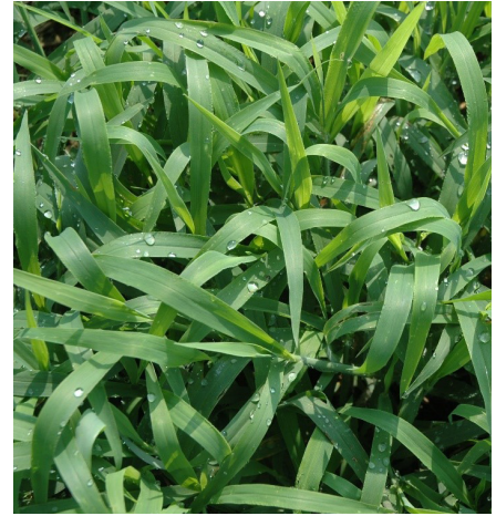
Figure 7. Crabgrass.

Crabgrass is sometimes considered a weed, but possesses significant potential for supplying high quality summer forage (Figure 7). Crabgrass does not have prussic acid potential and is a poor host for the sugarcane aphid. Crabgrass is the general term for many Digitaria species. Commercial seed usually contains Digitaria sanguinalis (large or hairy crabgrass) or D. ciliaris (southern crabgrass). A primary advantage of crabgrass is that it is well adapted to Kentucky and occurs naturally in most summer pastures, especially those that have been overgrazed. It is also highly palatable and a prolific reseeder. Planting an improved variety of crabgrass is recommended because the production of naturally occurring ecotypes varies greatly. Crabgrass is best utilized by grazing. For more information, see AGR-232: "Crabgrass."