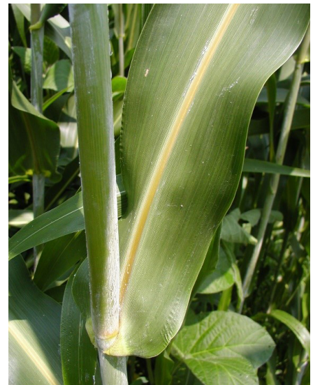
Figure 8. The brown midrib trait in forage sorghum.