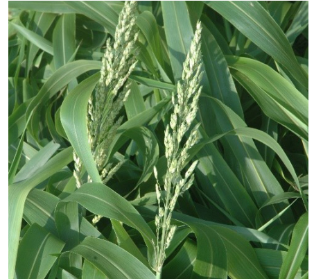
Figure 2. Sudangrass.

Sudangrass is a rapidly growing annual grass of the sorghum family. It is medium yielding and well suited for grazing (Figure 2). Sudangrass regrows quickly after harvest and can be grazed several times during summer and early fall. This grass has finer stems than most other summer annuals making it well suited for hay production. For more information, see AGR-234: "Sudangrass and Sorghum-sudangrass Hybrids."