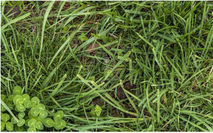
Figure 2. Bluegrass, orchardgrass, and tall fescue grasses.

Desirable Grass Diversity. Desirable grass diversity is an indicator that represents the various desirable grass species in a pasture. Again, the three main desirable grasses in Kentucky are Kentucky bluegrass, orchardgrass, and tall fescue (Figure 2). According to the Natural Resource Conservation Service, it is important to have desirable grass diversity because pastures with high grass diversity tend to recover quicker when there are negative impacts on a pasture. (For a guide to forage identification, see AGR-175: Forage Identification and Use Guide .)