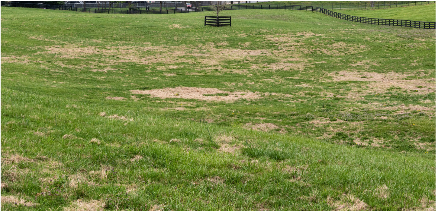
Figure 11. Pasture with thatch.

Thatch/Color. Thatch or plant residue is dead plant matter that is covering the soil (Figure 11). When there is a lot of thatch occurring in a pasture, it can limit the productivity of desirable species. The overall color of the pasture is another good indicator of pasture health. A dark green pasture is an indication of a productive pasture because the dark green leaves show that nitrogen is adequate in the soil and is being efficiently used by the plant. Adequate nitrogen allows grass to grow more vigorously and improve forage quality. If there is a heavy thatch layer present, this often suggests that soil microbiological activity is low because the soil microbes are essential for plant residue decomposition.