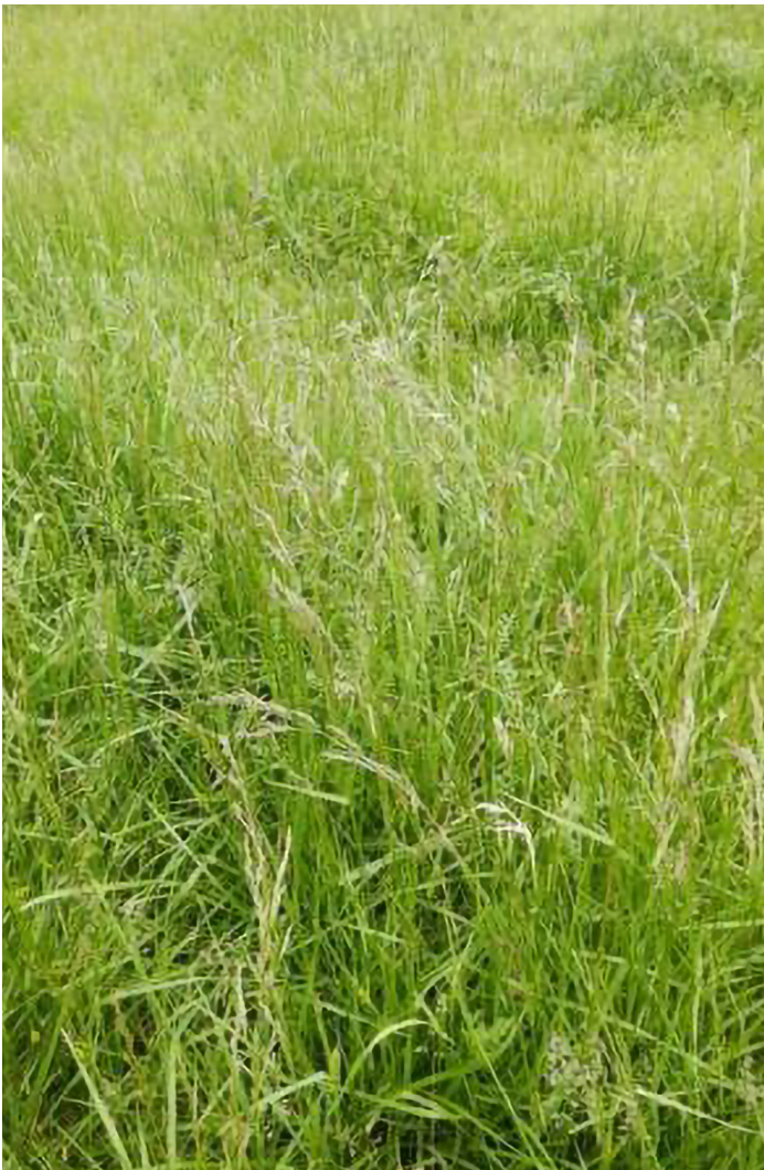
Figure 8. Seedheads present in pasture. Stage of Growth Score: 1.

Stage of Growth. When there are seedheads present on a plant, it limits the amount of vegetative growth because the plant is using its energy for seed production (Figure 8). In the case of tall fescue toxicity, there is a high concentration of ergovaline in the seed head and stem (for more information on endophyte-infected tall fescue, see ID-144: Understanding Endophyte-Infected Tall Fescue and Its Effect on Broodmares ). Mowing can control seedhead growth and increase vegetative growth.