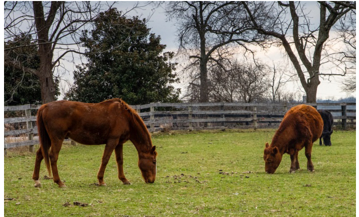
Figure 7. Overgrazed pasture with low grazing management. Grazing Management Score: 2.

Grazing Management. The grazing management indicator is based on the height of the desirable forages growing in a pasture. Horses tend to graze close to the soil and often graze in the same areas which can lead to an overgrazed pasture (Figure 7). Pastures that are grazed low to the soil repeatedly often becomes less productive which can allow undesirable species to take over the overgrazed area. Overgrazing can also lead to soil erosion and weed encroachment. There are some forages and specific forage varieties that can be planted that are known to be more tolerant to horse grazing. (For more information on cool-season grazing tolerance, see the 2021 Cool-Season Grass Grazing Tolerance Report ).