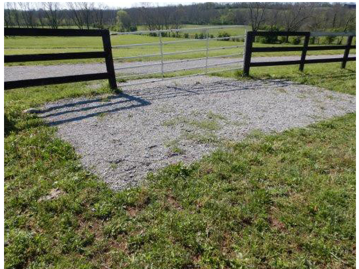
Figure 9. High-traffic pad in use. Loafing Area Score: 5.