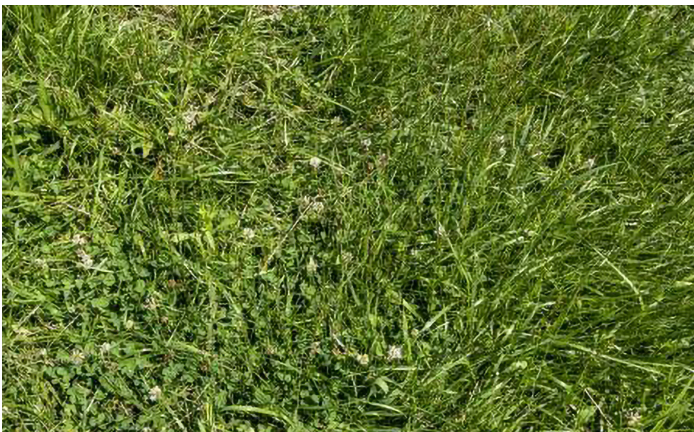
Figure 3. With the white clover present in this pasture, the legume score is 5.

Legumes. Having some type of legumes in a horse pasture can be beneficial. The main legumes you will find in horse pastures are white clover, red clover, and sometimes annual lespedeza or hop clover (Figure 3). (For a better guide to forage identification, see AGR-175: Forage Identification and Use Guide .) Legumes are beneficial to a pasture because they can fix nitrogen from the atmosphere into the soil. This can reduce the requirement for nitrogen fertilization. (For more information on pasture nutrient