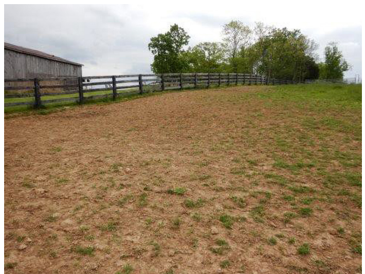
Figure 10. Loafing area extends into the grazing area of pasture. Loafing Area Score: 2.

Loafing Areas. Loafing areas are where there is excessive horse traffic, such as by the gate, water, and fence line (Figures 9 and 10). These areas can quickly be reduced to bare soil, which decreases the amount of desirable grass cover and encourages weed growth. Bare soil turns to mud in wet weather which can be dangerous for horses and people. Mud is also not good for horse hoof support and can lead to horses losing shoes. Using a heavy traffic pad can help prevent mud from forming in an area that is going to be bare soil due to the increased traffic (For more information on high traffic pads, see ID-164: High Traffic Area Pads for Horses ).