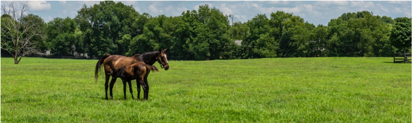
Figure 1. Horse pasture with dense cover of desirable grasses. Desirable Grass Cover Score: 4.