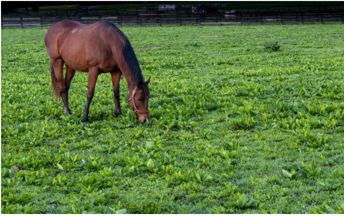
Figure 5. A horse grazing in a pasture full of the weed plantain.

Broadleaf Weeds. Broadleaf weeds are a common occurrence in horse pastures and small percentages are not a concern (Figure 5). Knowing how many and what weeds are in a pasture is important for weed control. If weed control is a main concern, it will be important to note the commonly occurring weeds in a pasture so that an accurate herbicide recommendation can be made. A few common weeds in Kentucky pastures are buttercup, plantain and ragweed (For a more complete list of broadleaf weeds and the corresponding herbicides, see AGR-207: Broadleaf Weeds of Kentucky Pasture ). There are many cell phone apps, such as Picture This and iNaturalist , that can be downloaded for free or for a small price that can help identify weeds in pastures.