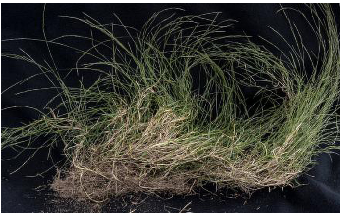
Figure 6. Nimblewill with seedheads present.

Perennial Weedy Grasses. Nimblewill is the main perennial weedy grass that occurs in horse pastures in Kentucky (Figure 6). Nimblewill is a native grass to Kentucky, therefore it thrives well in Kentucky horse pastures and is hard to control. Unfortunately, horses will not eat nimblewill due to it being unpalatable. Another