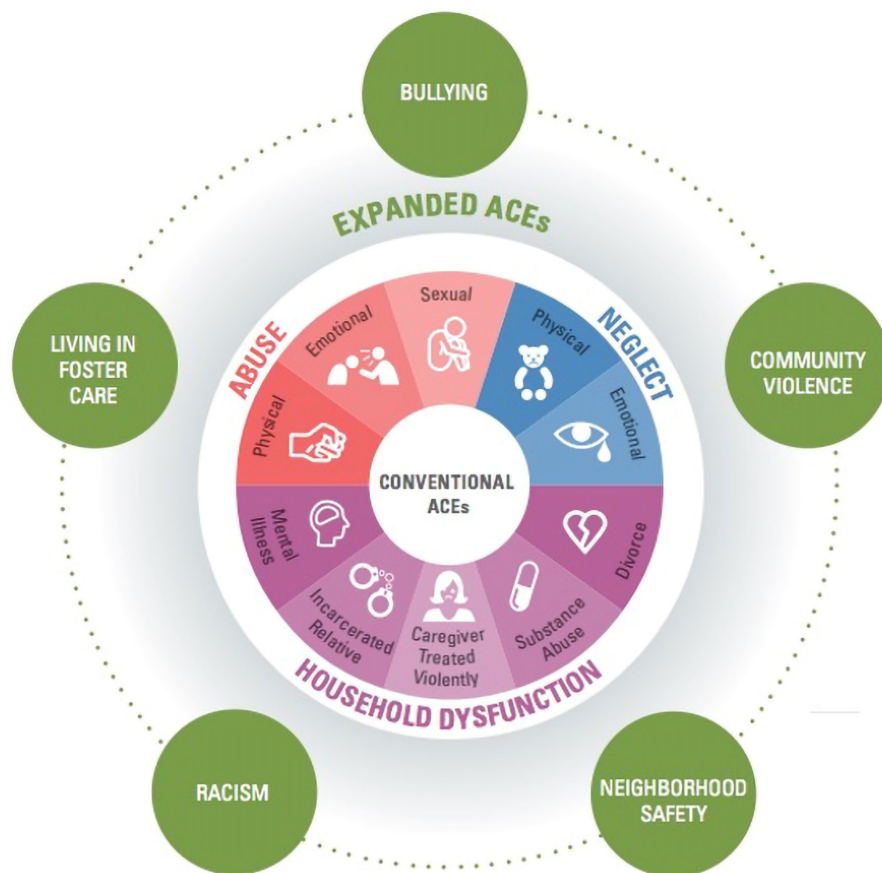
Figure 2. Examples of adverse childhood experiences.