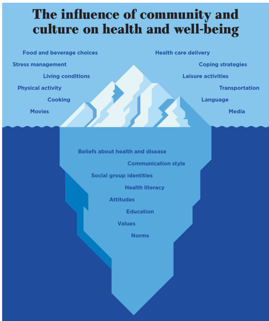
Figure 1. Cultural influences on health are like an iceberg: Some factors are easier to see than others.

people in the same community will have the same life experiences or views about health and well-being.