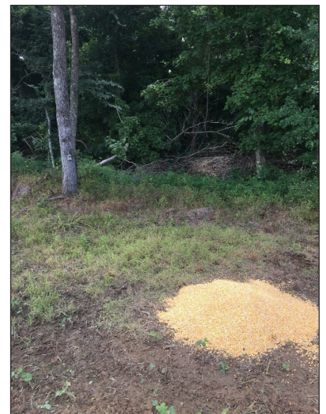
Figure 3. Example of camera placement

Some people prefer to add a numbered sign or post in each camera shot to ensure that they know from which camera each picture comes. Another alternative is to label the SD cards for each camera. Regardless of the method, keeping track of the source of each picture can be an important factor when identifying individual deer.