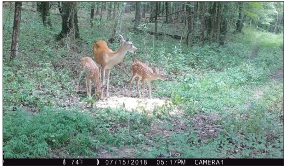
Figure 1. Adult doe and her two fawns

Predators can play a role in fawn recruitment by removing fawns from the landscape; however, this varies drastically by locality and fawn survival. Research in Kentucky has not shown that predators impact deer populations in the state. Habitat quality is much more important than predator control to increasing fawn recruitment in most areas. A study from Pennsylvania showed that in forested habitat fawns have a 40 percent survival rate to nine months of age, compared to 50 percent in agricultural habitat. These numbers are consistent with other studies across the country. In southern Illinois, areas that have more diverse habitat saw higher survival rates than areas with a more monoculture landscape.