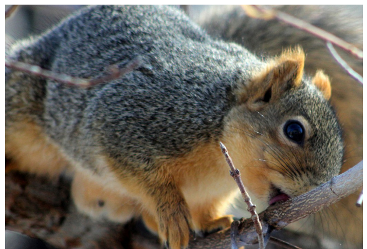
Figure 2. Common color phase of the northern fox squirrel in Kentucky.