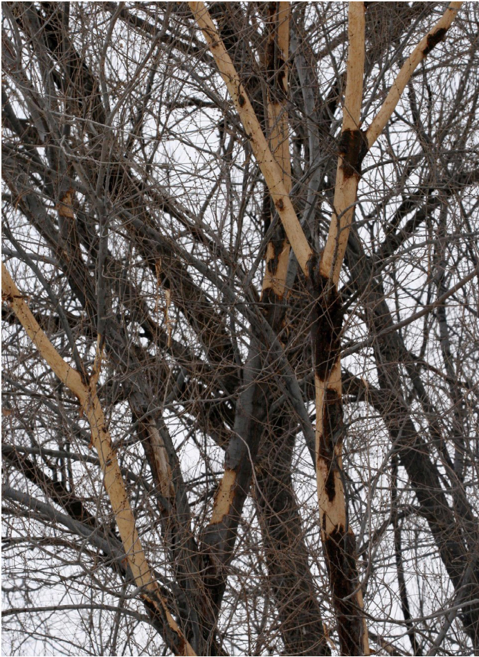
Figure 3. Damage to tree branches by squirrels.

Mothballs had been recommended for use to cause squirrels to vacate buildings, however they are no longer labeled for use on anything other than moths and caterpillars. This is due to their toxic nature and potential harm to humans and other wildlife.