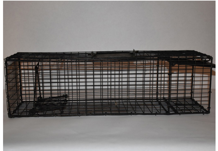
Figure 6. Live trap used for squirrel control.

Several of these solutions may discolor wood; treat a small area hidden from view first to determine the amount of discoloration.