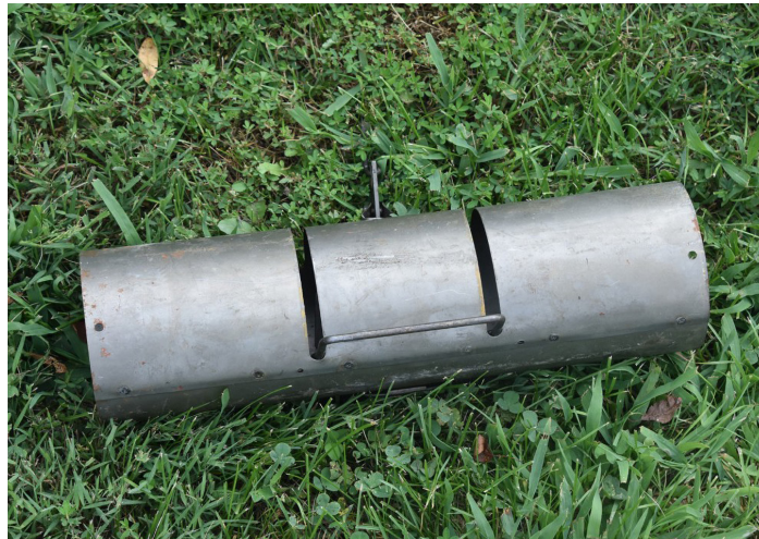
Figure 5. Body-gripping trap available to be used for squirrels.

One method of keeping squirrels from browsing on trees and gnawing on wood is to use a chemical repellent. Repellents do not stop gnawing damage, but they do reduce the severity of damage.