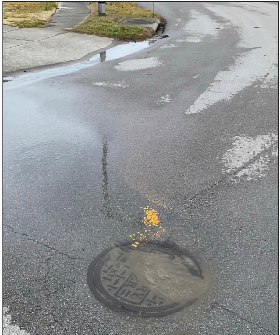
Figure 1. A sanitary sewer manhole in a separate system overflowing into a nearby storm sewer that discharges directly to a local waterway.

SSOs are an important concern because they can potentially result in the discharge of the contents of the sanitary sewer (raw sewage), which can ultimately end up in local waterways (Figure 1). Exposure to untreated sewage can lead to illness from pathogens that are often present in human waste (e.g., E. coli, norovirus, hepatitis A). Sewage also contains significant concentrations of nutrients (specifically nitrogen and phosphorus) that can lead to algal blooms or eutrophication (nutrient enrichment that can alter ecosystem processes) in downstream waterways. SSOs can also occur in the basements or crawl spaces of