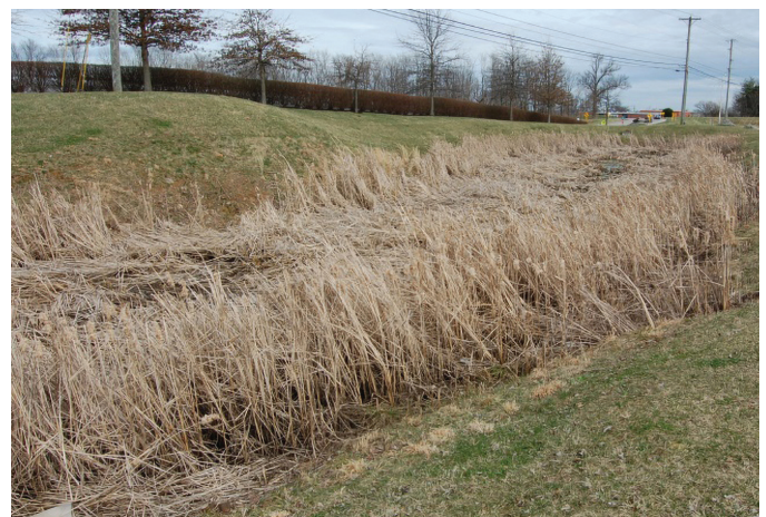
Cattail, an invasive plant species, is covering the entire surface area of this retention basin.