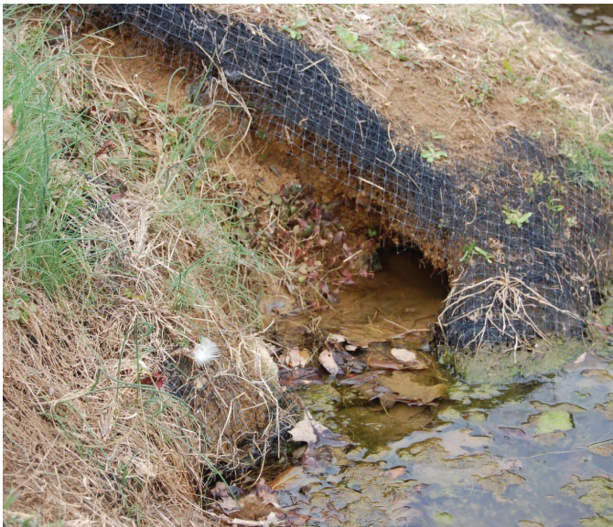
A muskrat has created a hole in the turf reinforcement mat and a tunnel into the bank, destabilizing the embankment.