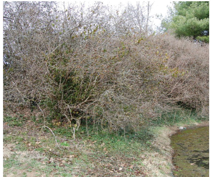
Japanese bush honeysuckle, an invasive plant species, is invading this embankment.