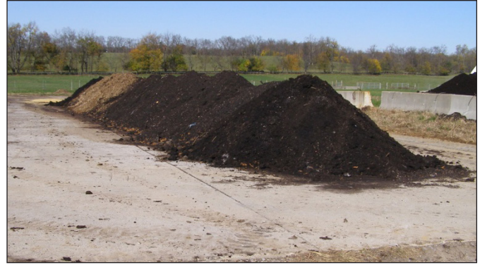
Figure 4. These livestock compost piles have been properly covered. The windrow system allows for easy access and creation.