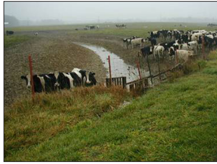
Figure 2. Cattle with full access to this stream have denuded vegetation, damaged stream banks, and polluted water resources.

Lagoons and liquid storages need to be managed to minimize the amount of clean water that can enter the system. Clean water reduces storage capacity, and—if not accounted for—this extra water can cause an overflow. Diverting clean water from roofs and headwaters away from storage structures and inspecting gutters and downspouts to make sure they are in good working order can help preserve storage capacity. Regulators require a manure storage facility to have a capacity that can handle the manure and runoff from the production facilities, normal rainfall events, a 24-hour 25-year storm event (which is about 5.25 inches of rain in Kentucky), and at least one foot