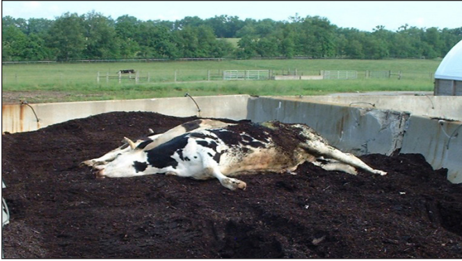
Figure 3. These fallen dairy cows have been placed in a composting structure, which is a good practice for disposing of fallen livestock when the approved state guidelines are used. These animals will be covered with 3-4 feet of bedding material to complete the pile, which deters vermin.