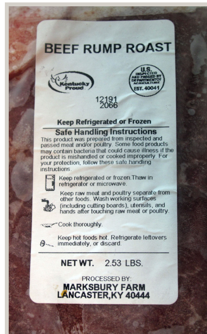
USDA inspected beef: This is the processor's label that can also be used for selling retail cuts.

Label Submission and Approval System (LSAS) ( http://www.fsis.usda.gov/wps/portal/fsis/topics/regulatory-compliance/labeling/labeling-procedures/label-submission-and-approval-system/lsas )