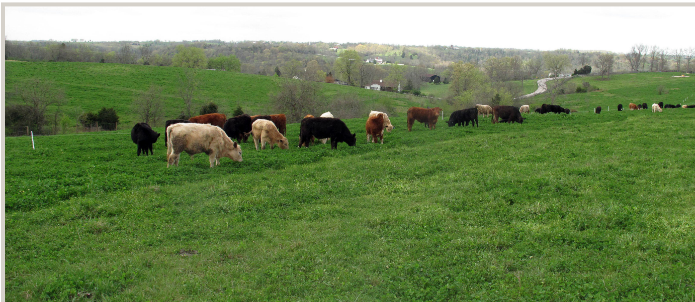
Rotational grazing calves in early spring: Cattle should be moved quickly in spring to avoid the last paddocks in the grazing system becoming overmature.

paddock system. For finishing animals, it was determined that a grazing residual of at least four inches should be left when animals are moved out of the paddock to maintain a high plane of energy intake.