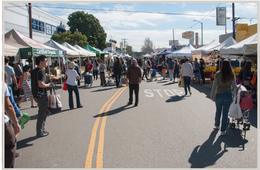
Farmers market: A great place to find customers looking for pasture-finished beef.

What an animal was fed and how it was aged can influence the flavor of your beef. The majority of the beef consumed in the United States is grain-fed and wet-aged. Farmers promoting forage-fed beef will need to educate their customers about the flavor. Forage-fed beef has a different flavor profile than traditional grain-fed beef due to the forages the animals consumed. Also beef purchased from a grocery store has been wet aged, meaning the carcass was fabricated into wholesale primal cuts 24 hours postmortem, sealed in a vacuum bag, placed in a box, and aged during transportation to the grocery store. Local meat processors will generally only dry-age beef. Dry-aged beef has a flavor that has been described as nuttier or earthier when compared to traditional wet-aging. Once again, customers will need to be educated on the flavor and aroma difference of dry-aged beef.