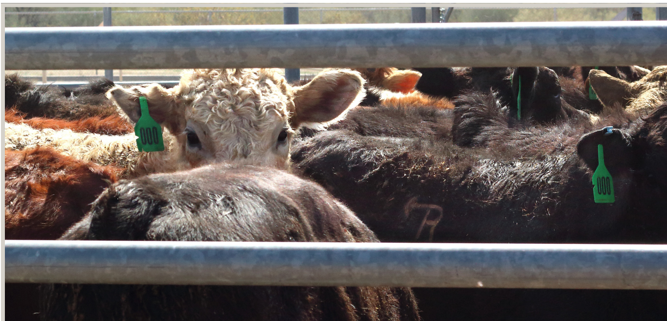
Wholesale beef cattle market.

with these activities. You will also typically sell at a lower price and have a lower profit potential on a per animal basis, but this method allows you to concentrate on the production side and let someone else worry about the processing and marketing. Thus, wholesale markets may be a viable option if you are good at finishing cattle but do not want to do the marketing to sell a final product.