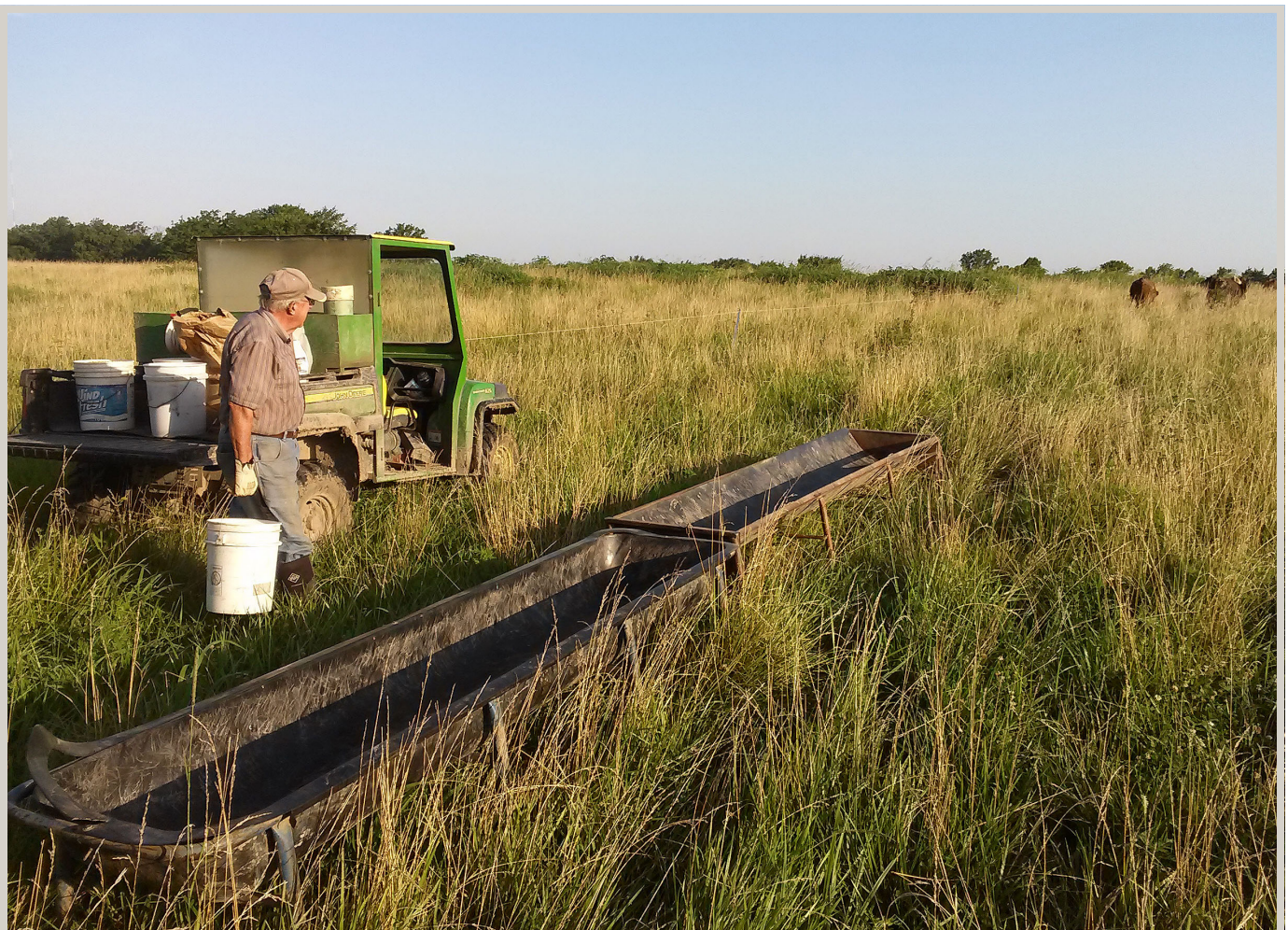
Grain supplementation: Supplementing a pasture diet with grain allows for an earlier harvest and more consistent finishing quality. The earlier harvest is particularly important with spring-born calves that you are trying to finish before their second winter.

The grain-on-grass production process varies widely. Grain-on-grass systems as described in this publication assume that no more than half of total energy intake is from concentrates and that animals will at minimum be grazing pastures during periods of active vegetative growth. This process generally means 1.0 percent or less concentrate intake on a dry matter basis based on bodyweight. Typically, finishing cattle offered a high concentrate diet have an average total intake ranging from 2.25 to 2.75 percent of body weight on a dry matter basis. Higher grain feeding levels will for practical purposes more closely resemble a feedlot diet. However, there are some producers who grow calves on forage during the grazing season followed by 60