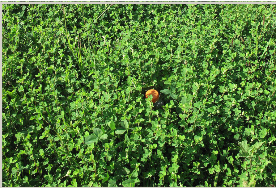
Annual lespedeza: Good stand of annual lespedeza in mid-July that was frost seeding into pasture in late winter. Lespedeza is an excellent quality forage for use in July and August.