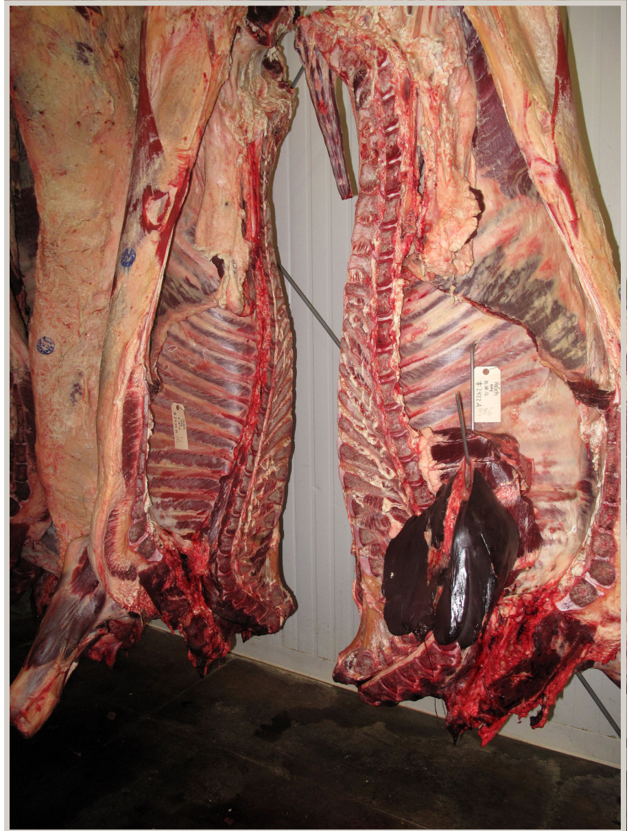
How finished is this carcass? A 736-pound carcass from an 1,195-pound liveweight grass-finished steer. The steer graded low select and yielded 522 pounds of wrapped meat (not including by-products).

Selling freezer beef is often an easier option than selling individual retail cuts, but it requires the most consumer education. Freezer beef is a term used when individuals wish to purchase a whole, half, or quarter of a beef carcass. This option has the