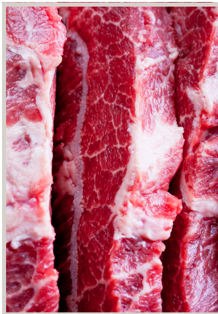
Good marbling is possible in pasture-based finishing systems with proper management.

Marbling refers to the flecks of fat inside the muscle, and the observed amount determines the USDA beef quality grade. The age of the animal at the time of harvest and the amount of marbling present in the ribeye at the 12th/13th rib interface are used to calculate the USDA beef quality grade. The age of the animal at the time of harvest predicts the potential tenderness of the meat, as the steaks and roasts will be tougher from older animals (>30 months). The amount of marbling, predicts