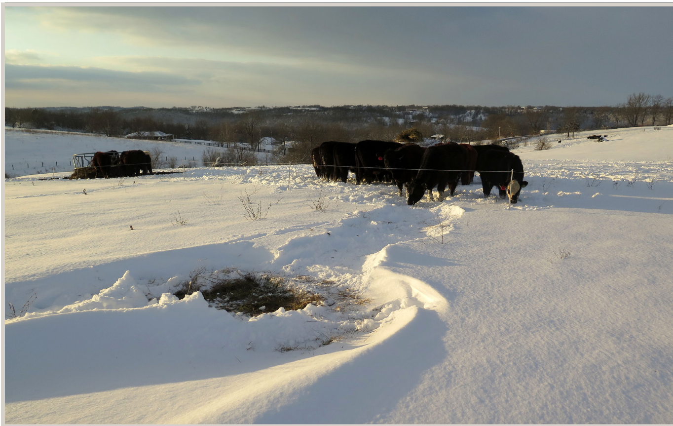
Yearling steers being fed hay in deep snow: Winter feeding is one of the biggest costs for finishing animals on pasture.