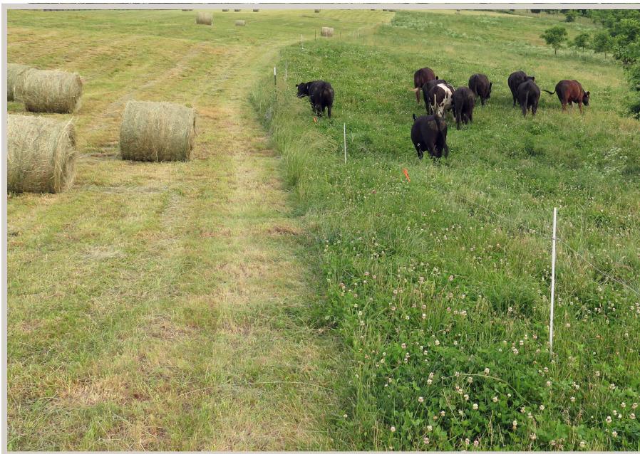
Making hay from excess pasture: This pasture was grazed twice in early spring, set aside for six weeks, and cut for hay in early June. Quality was excellent compared to traditional hay cut at this time.

harvesting grass at the boot stage rather than the late flowering stage will increase the gain potential of the hay.