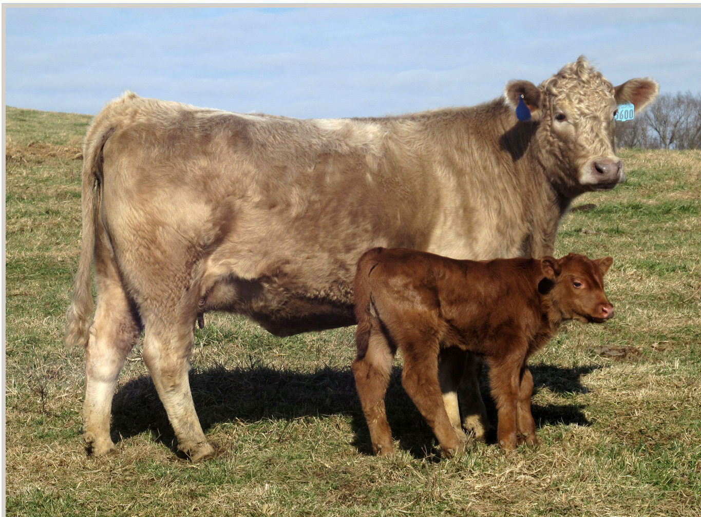
Kentucky beauty: The ideal grass-finishing phenotype cow with a moderate-small frame height and deep, thick body. Her first calf is standing by her side.

as the Lowline, Jersey, or Dexter may best suited to this system. In between these two extremes are a variety of breeds that would work well (see Table 5). Identifying genetics that will work for your system also requires being productive under the environmental conditions in your region. For example, breeds or genetic lines that do not shed their winter hair coat in spring will experience greater heat stress and lower performance during the summer months in hot humid regions of the upper south.