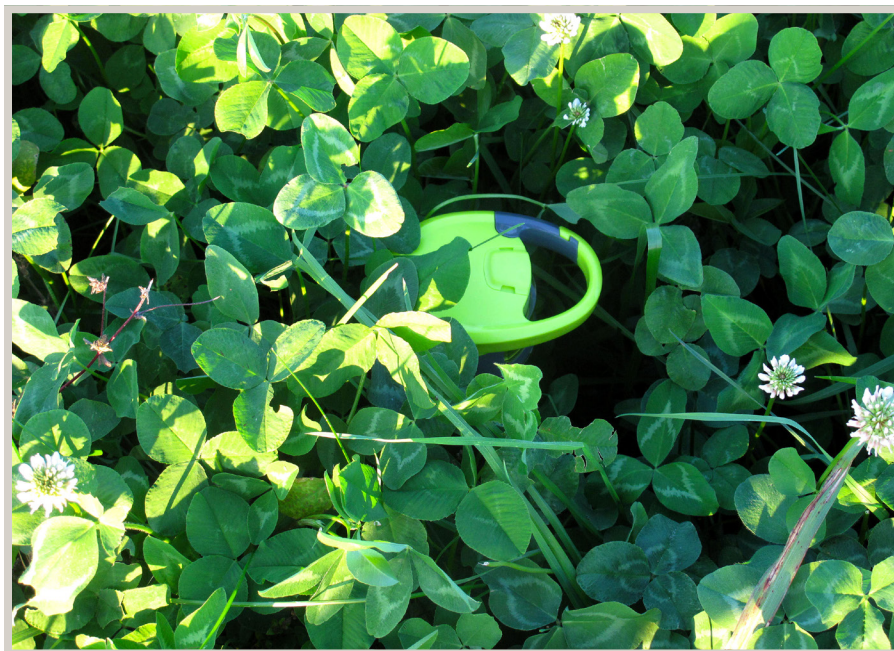
Ideal mix of clover/grass for finishing cattle: Pasture sward 8 to 12 inches tall with lots of clover has potential for high gains.

Seeding alfalfa into tall fescue stands will also increase animal performance and, due to its deeper root system, provide better summer production compared to other cool-season forages. Well-managed alfalfa-grass stands increase both quality and yield of the pasture, greatly improving overall production. Grazing varieties of alfalfa have been developed, but hay varieties can be utilized successfully under