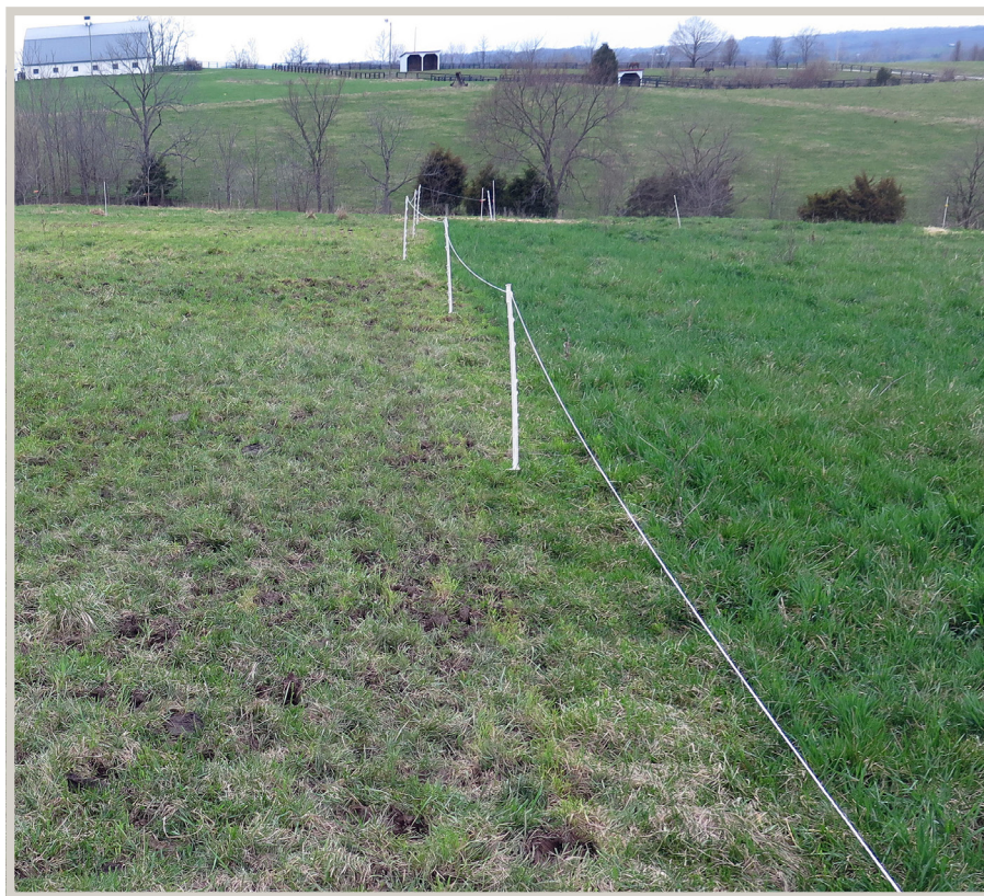
Late winter grazing of cereal rye: Cereal grains have excellent forage quality at this time of year.

to fill the summer slump. Although there is much variation on forage quality between the summer annuals, they will generally produce better gains during the summer compared to perennial pastures. Summer annuals should only be used on good soils with low soil erosion potential.