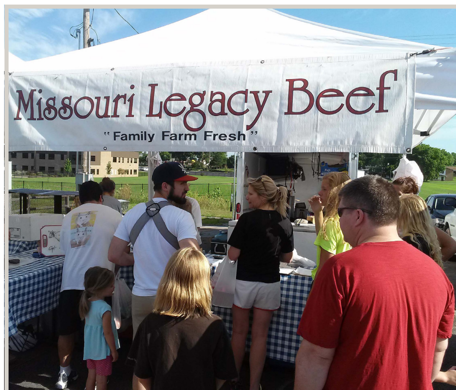
Selling locally produced beef at farmers markets has becoming increasingly popular in recent years.

Given all these constraints and challenges, freezer beef is still a great way to get started with pasture-finishing cattle. It is possible to sell a thousand pounds of meat while only dealing with six to eight different customers. You may be able to use only word-of-mouth advertising and not have to hold a single package of meat in inventory.