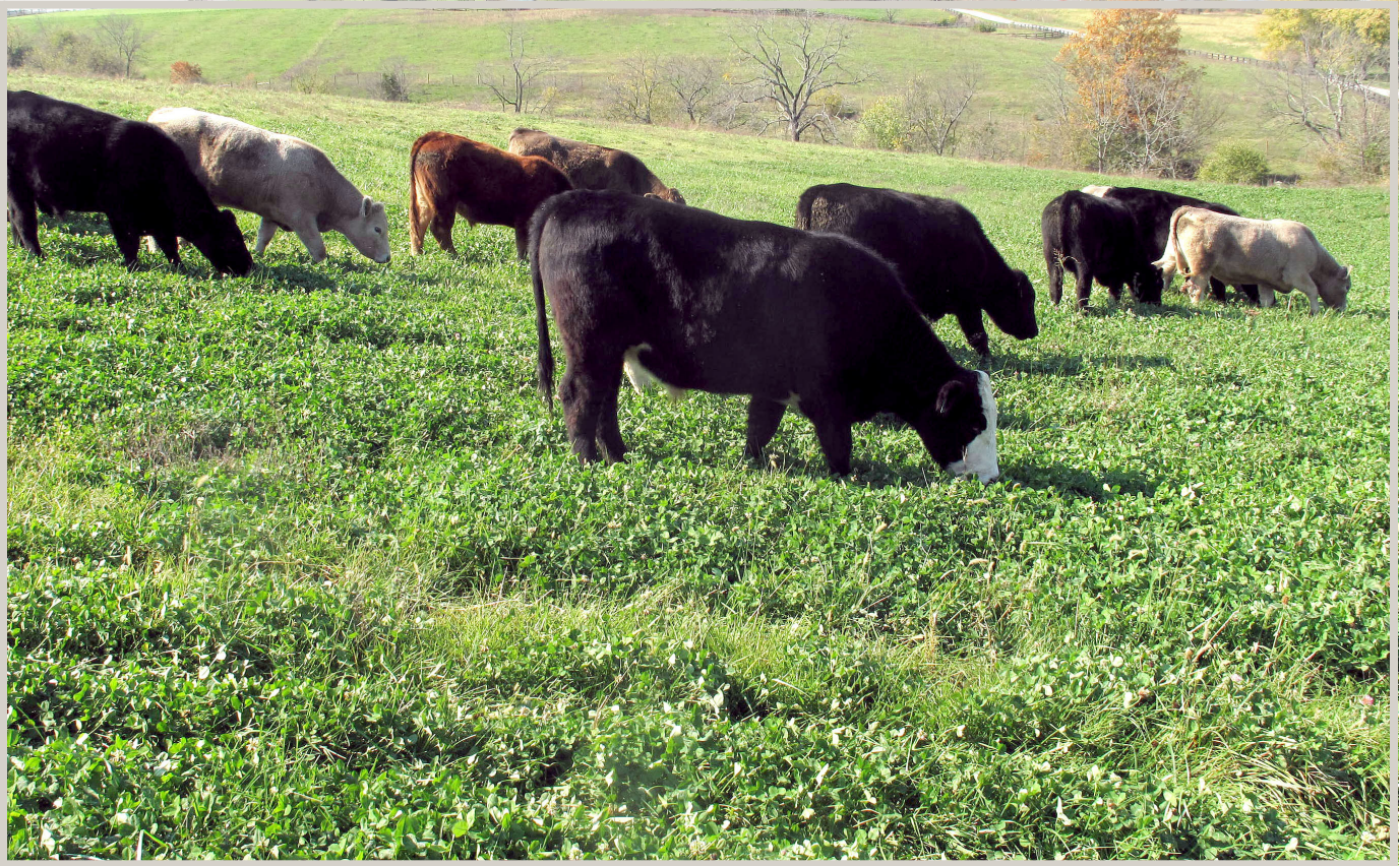
Eight to nine hundred pound steers grazing in early November: Fall-born calves from the previous year with good management will easily finish by the next fall (23 to 26 months old).

Although most cow herds could be characterized as spring or fall calving, undefined or year-round calving is still fairly common. This calving option provides distribution of calves for finishing and marketing throughout the year. However, this system results in management and marketing difficulties (for the commodity market) and is typically discouraged.