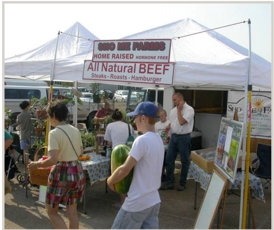
Naturally raised beef has become a popular market segment in recent years.

What exactly defines “local” is not clear. To some individuals, it will mean the small community they live in. For others, it may mean being in