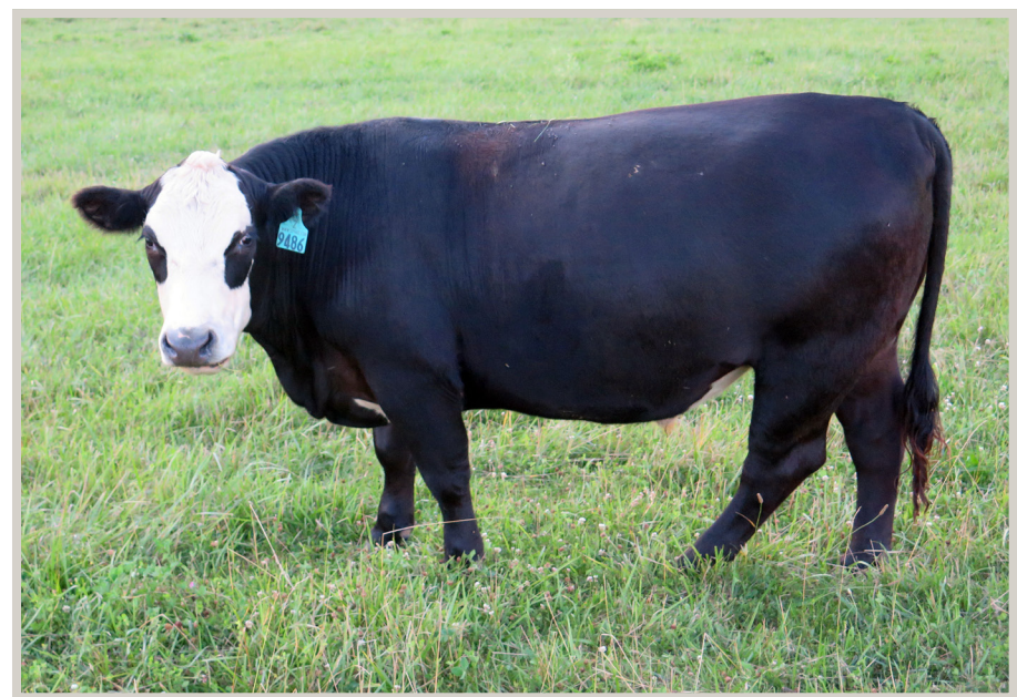
An ideal grass-finishing phenotype steer: Moderate-small frame height but deep, thick body. This steer is probably finished at this point but will go another three months before harvest.

Most cow-calf producers are familiar with body condition scores. Body condition scoring of beef cows ranges from 1 (an emaciated animal) to 9 (an animal that is excessively conditioned). This system can be