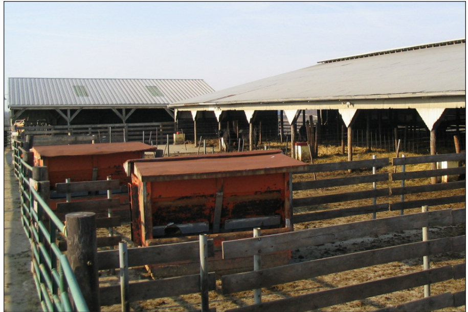
Figure 2. A typical paved feeding area with a guttered roof to redirect clean water away from the production area.

To establish a filter strip, plant or maintain a dense grass sod in strips to help protect water quality by reducing soil movement. When there is little or no existing vegetation, follow pasture and hayland planting or forage and biomass best management practices. Leave existing natural vegetation along streams or