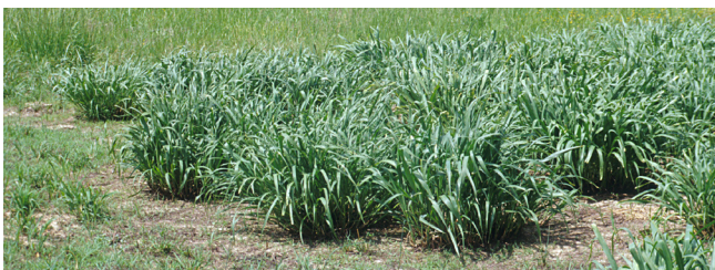
Eastern gamagrass develops "clumps" that spread from short rhizomes.

Eastern gamagrass is a bunchgrass that produces short, thick rhizomes near the soil surface. It is among the highest quality native warm-season grasses, with high palatability and digestibility and one of the longest growing seasons. Individual plants grow in size as the surface rhizomes spread outward forming large circular clumps over time, with the center often becoming open after a few years. Leaves of eastern gamagrass emerge from the base of the clump and may easily reach a length of 3