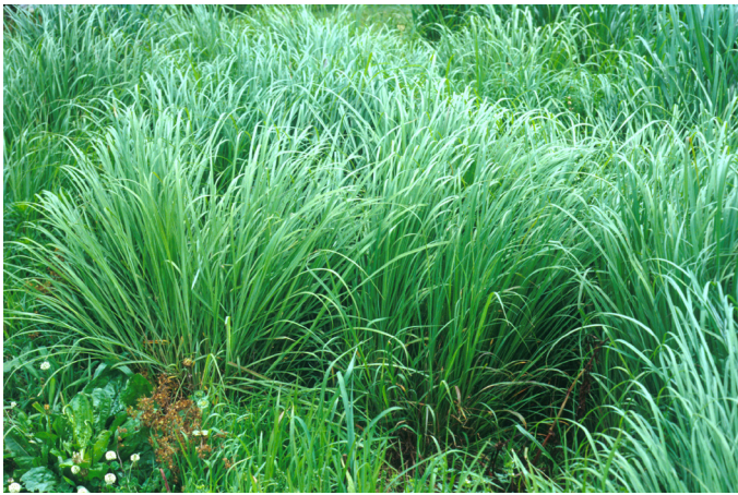
Big bluestem ready for first harvest.

Big bluestem is a tall growing (6 to 8 feet) bunchgrass with generally higher forage quality than switchgrass. It also provides excellent wildlife habitat. Yield potential is generally less than switchgrass and eastern gamagrass; however, big bluestem is more drought tolerant and can be grown on poorer soils—especially those that are shallow and steep. The seed are small and have appendages that impede gravity flow through the distribution tubes in most seed drills. Seed can be debarbed, but even then, drills with specially modified warm-season grass seed hoppers may be necessary for even seed distribution. Big bluestem produces most of its growth after June 1, a date that coincides with the decline in production of cool-season grasses. Its good forage quality and relative ease of drying make it the preferred native warm-season grass for hay production for beef cattle, horses and other livestock species or it can be used for grazing, especially in July and August.