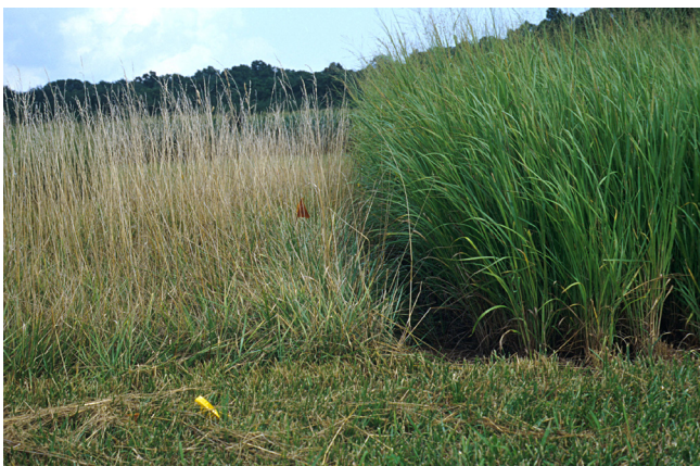
Switchgrass in July, with tall fescue on left.

Switchgrass is a tall growing (4 to 9 feet), wide-leaved grass that produces short rhizomes so that individual plants increase in size over time. The seed are similar in size to orchardgrass and are smooth; unlike other native warm-season grasses switchgrass seed flows easily through most drills. Switchgrass becomes thick stemmed as it matures, so it needs to be harvested at an immature stage (before seed heads emerge) for good quality forage. The first harvest in Kentucky should generally be no later than early June. Upland varieties such as Cave-in-Rock and