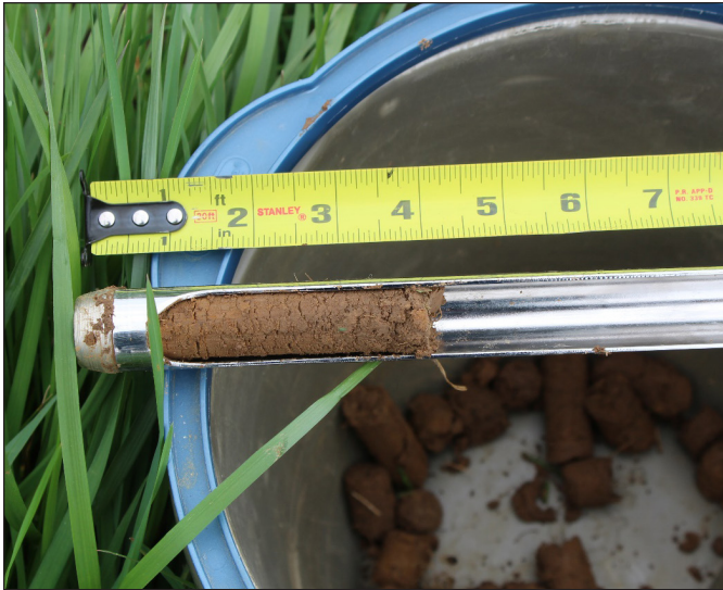
Figure 2. A soil probe should always be used to collect soil samples. Sampling depth for pastures and hayfields should be 4 inches.

Always sample pastures and hayfields using a soil probe. Although other tools can be utilized, soil probes are very easy to use, and result in the most uniform soil cores (Figure 2).