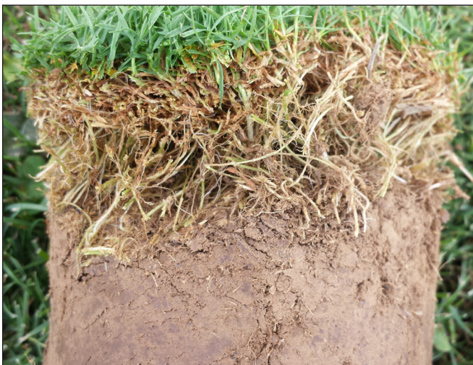
Figure 1. Check for thatch by using a knife or soil probe to remove a core. The dense organic layer above the soil line in this image is a mixture of thatch, roots, and rhizomes.

Select a dethatching machine that cuts with knives or blades (Figure 2). Some machines have flexible, leaf rake-type tines that are ineffective in removing thatch. Spring tines that can be attached to your rotary mower blade are not good for dethatching either and can cause severe mower damage. Dethatching equipment can often be rented from lawn equipment rental companies.