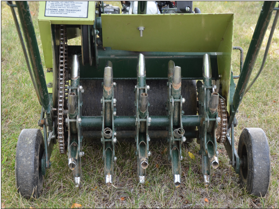
Figure 5. A common lawn aerifier available at rental agencies. This roller-type aerifier inserts tines as it rolls along.