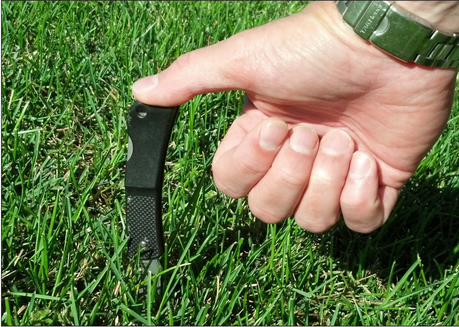
Figure 7. Check for compacted soil by trying to push the blade of a knife into moist soil with just the force of your thumb.