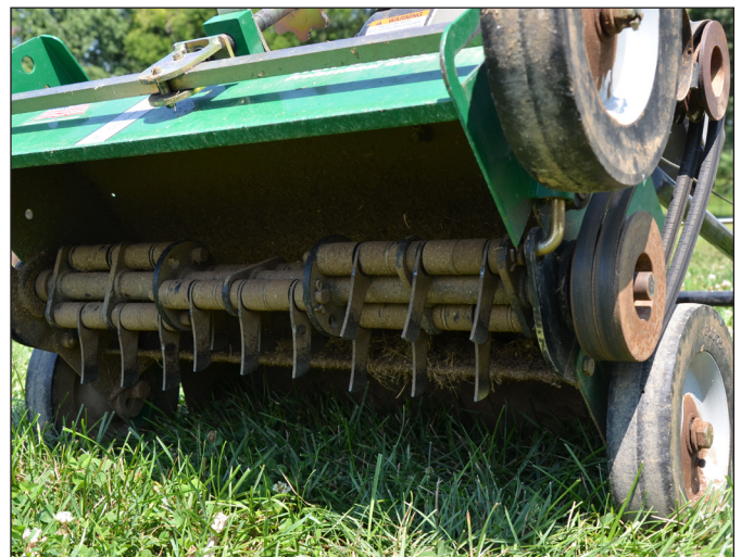
Figure 2. A good dethatching machine has fixed knives or sling blades; spring tines are not effective.