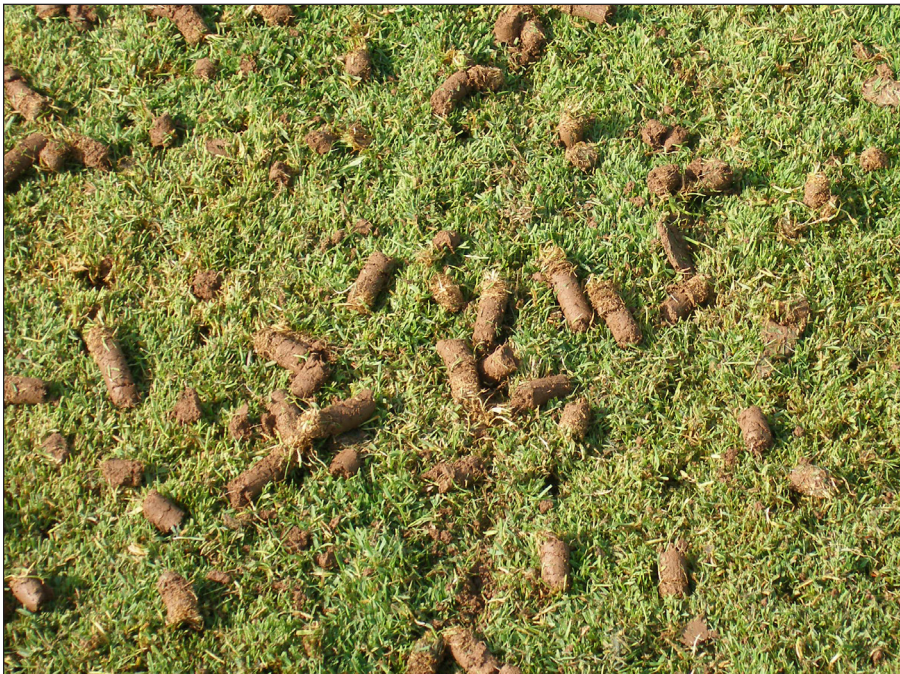
Figure 6. Coring machines remove plugs of soil and grass and open up the soil for improved aeration and water infiltration.