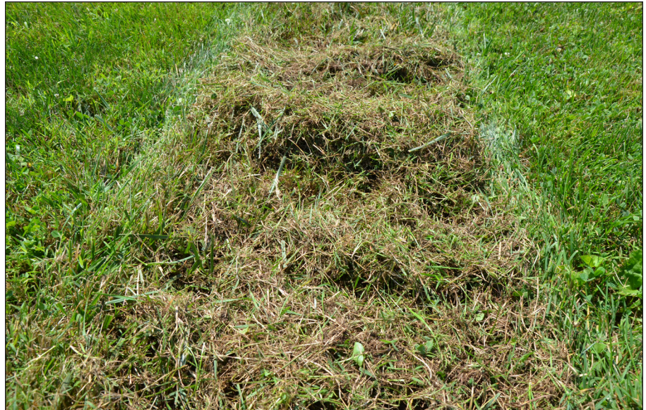
Figure 3. A mixture of thatch, soil, roots, and stems removed with just one pass of a dethatching machine.

You can reduce your need for dethatching by keeping up with the proper maintenance of your lawn (or neglecting it completely). Reducing the amount of fertilizer applied to the lawn and only applying during the fall will help produce the healthiest lawn possible without excessive thatch buildup. (Most cool-season lawns only require 2 to 3 lbs of nitrogen/1000 ft 2 /year.) Managing your soil pH in the proper range is important for microorganism activity. Test the soil in your lawn every three to five years. Do not apply pesticides that kill earthworms. If you are not sure if a pesticide is safe for earthworms, contact your local county extension office for clarification. Finally, slit seed a turf type tall fescue into a Kentucky bluegrass lawn. In time the lawn will be a mixture of the two species and the numerous benefits of the tall fescue will be realized.