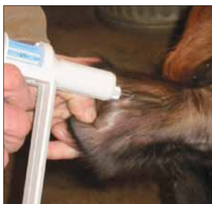
Figure 1. Administering an implant in the middle third of the backside of the ear.

Products are to be administered in the middle one-third of the ear unless otherwise directed by the label. Proper implant placement is illustrated in Figure 1. To achieve proper placement of the implant, it is important to insert the needle on the backside of the ear toward the tip of the ear allowing for the implant to be deposited in the middle third of the ear and not in the cartilage ring at the base of the ear (Figure 2).