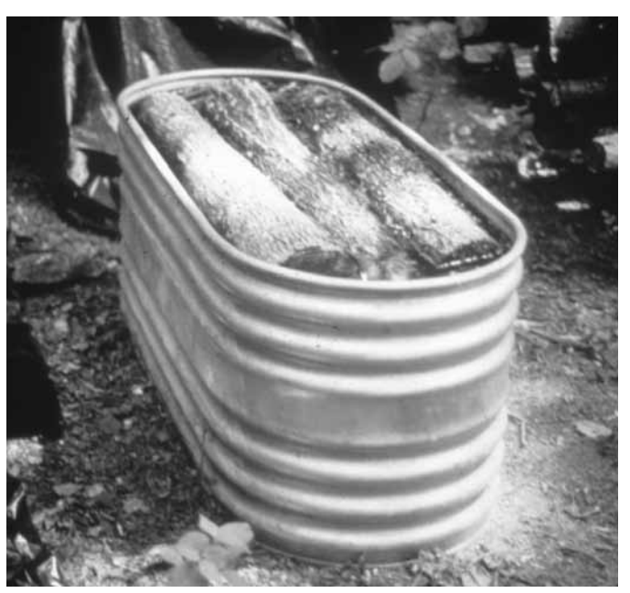
Figure 10. Immersing logs overnight when ready for production. Keep top logs under water.

Good packaging and quality control on your mushrooms will improve their marketability. Because there are no "automatic" markets for these mushrooms other than large produce markets in major cities, the "footwork" of establishing markets for your mushrooms must be done before you start inoculating logs and continue as your logs incubate and then produce.