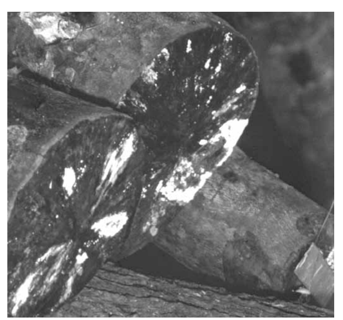
Figure 9. White mycelia showing on ends of incubated logs.

All crops need a market. Fine restaurants, especially of continental, French, or Asian cuisine, would probably be interested in buying these mushrooms fresh, but try selling them to your local pizza parlor, too. Health food/natural food stores and food cooperatives may also be interested in buying locally produced, fresh mushrooms. Shiitake are well enough known that they can be sold at farmers' markets. Large supermarkets are usually only interested in buying produce in large volumes on a regular basis (i.e., weekly), so they may not be a good outlet. Be prepared to sell the idea of this new commodity with recipes and cooking suggestions, along with some nutrition information, included with your label. You may want to do a cooking demonstration for local groups because often the flavor of these mushrooms helps them sell themselves.