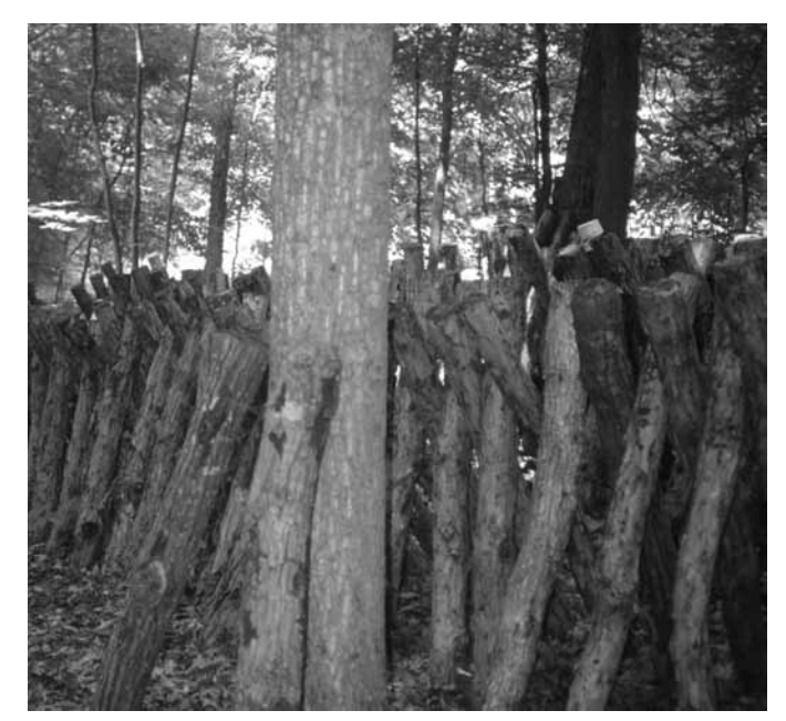
Figure 6. Teepee method of stacking logs.