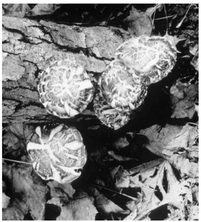
Figure 2. Dark chocolate brown shiitake mushrooms with split caps.