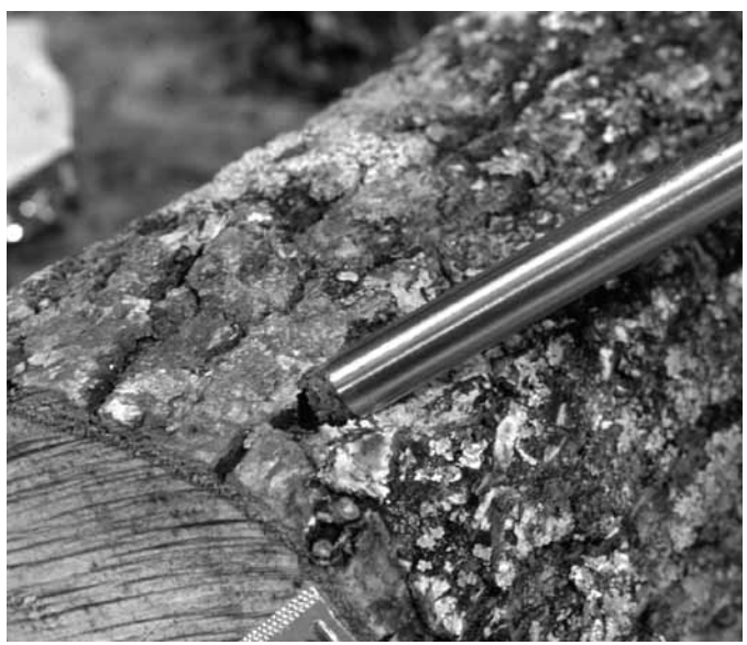
Figure 5. Injecting sawdust spawn into shiitake log.