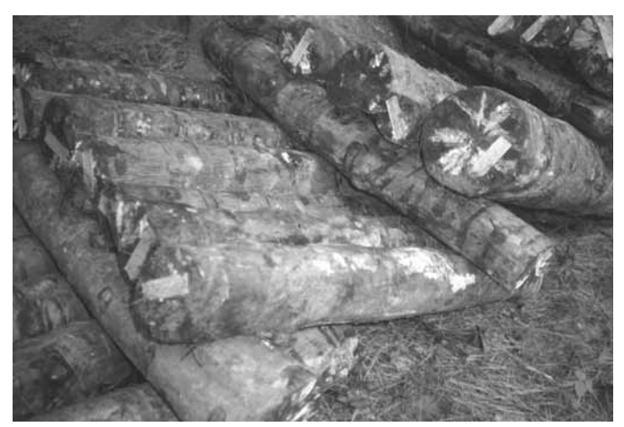
Figure 8. Lean-to method of stacking logs.

When mushrooms actually begin to appear, many growers change how the logs are stacked. From a lean-to position, the logs are stood on end teepee fashion, either around the base of a large tree or against a high (2½ to 3 feet off the ground) cross bar or wire so that you can reach all sides of the logs to harvest the mushrooms (Figure 6). Another option is a relatively short (5 logs high on each side) log-cabin stack, as its open middle and log-width spacing make it possible to