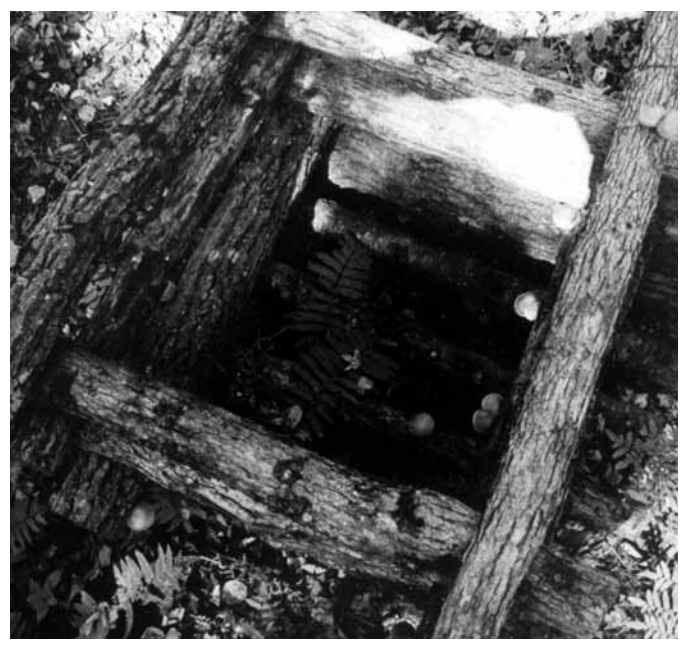
Figure 7. Log cabin crib method of stacking logs.

bottom logs. Logs should be moved around within the stacks several times during the incubation period. If mold appears on the logs, the logs need to be re-stacked more openly to improve air circulation so that further mold growth will be discouraged.