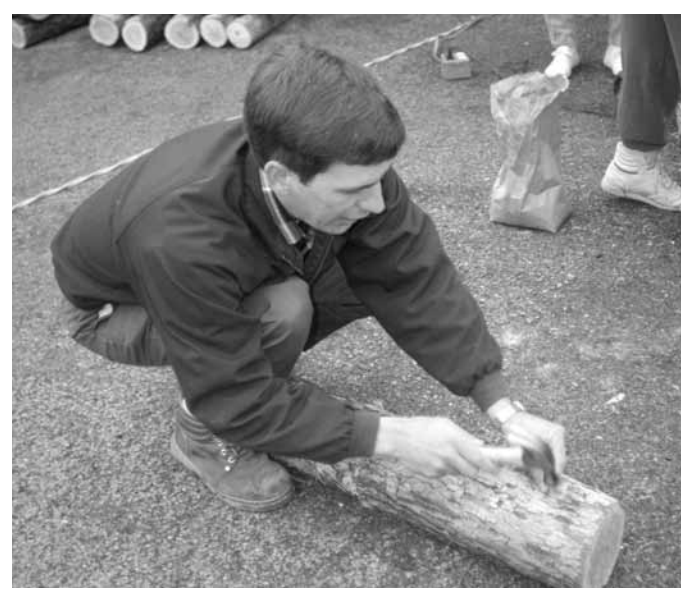
Figure 4. Hammering dowel spawn into shiitake log.

Logs can be stacked several different ways (Figures 6-8) for the incubation period (see FOR-83, Incubation and Stack-ing ). One of the best stacking methods is lean-to (Figure 8), where the logs are laid close to the ground, but on a clean surface such as gravel, not directly in contact with the soil. Other stacking methods include teepee stacking (Figure 6) and log-cabin stacking (Figure 7), where the logs are stacked higher off the ground. Placing the logs on a gravel bed (which could be laid down over fabric) and up on two or more base logs, or a recycled pallet will make it easier to keep water (and therefore good conditions for contamination) off the