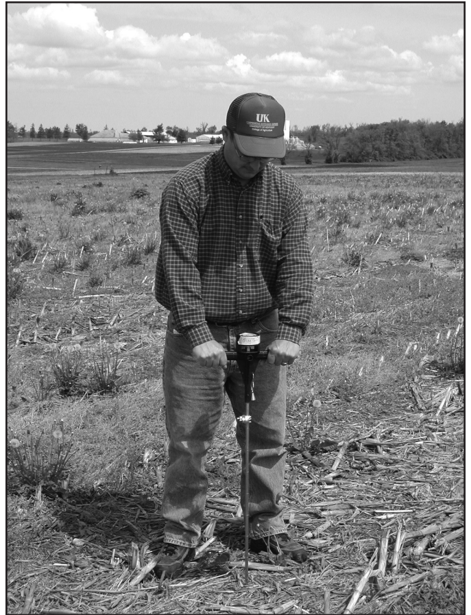
Figure 4. Measuring soil compaction using a penetrometer is similar to taking soil samples.

To use the penetrometer, slowly and steadily push it into the soil while watching the pressure gauge (Figure 4). The shaft of most penetrometers is calibrated in 3-inch increments so that you can determine the resistance with depth. As you push the penetrometer, record the highest resistance and the depth where the highest reading was obtained. Continue to push until the resistance drops, and note this depth as well. (A sample data sheet is included at the end of this publication.) If the pressure does not drop, then either the soil profile is not completely wet or you have hit a naturally dense soil layer that will not be remedied with subsoiling. These layers are most likely fragipan, heavy clay subsoils, or dry layers. Repeat the probing in random areas throughout the field. The more data you collect the more accurate the results will be. At a minimum, collect 10 to 20 readings in a small field or 30 to 40 in a large field. You may want to sample field entrances and high traffic areas separately.