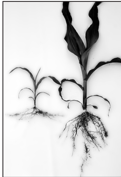
Figure 1. Corn plants collected from high (left) and low (right) traffic areas.

Tillage compaction is a result of the downward force exerted when tilling. Even implements (like a moldboard plow) that lift the soil can cause compaction at the leading edge of their blades. Tractor tires running in the bottom of the open furrow when making the next pass compound compaction problems. These actions can cause the development of a plow pan and reduce the effective rooting depth to the depth of tillage, usually only 5 to 8 inches. Plow pans are also common in tobacco fields as a result of using tractor-mounted roto-tillers to pulverize surface soil.