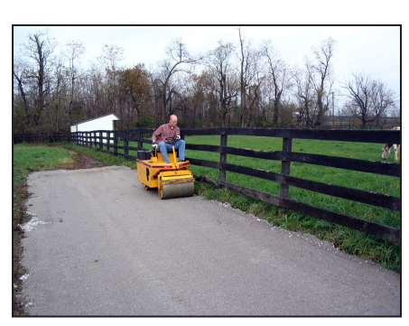
Figure 9. Compaction with drum roller.