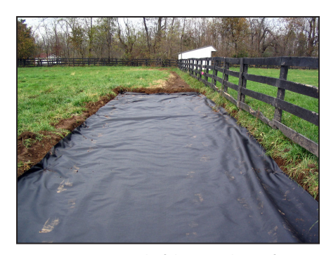
Figure 3. Geotextile fabric in place after excavation.

A layer of densely graded aggregate (DGA) (Figures 7 and 8) is used as the final surface material on the pad. Crushed stone mixes consisting of smaller gravel mixed with fine or some 57s in DGA can also be used. Sand has been used for the surface layer, but it tends to shift easily and does not provide firm footing for the animals. Once compacted, the DGA creates a roadlike surface that is easier to walk on than loose gravel but has some flexibility, which reduces the risk of hoof injuries. The compacted DGA also allows for easier cleaning of the surface. The surface layer is typically 2-3 inches deep and should be spread evenly and graded with a slight slope to allow the water to flow away from the pad.