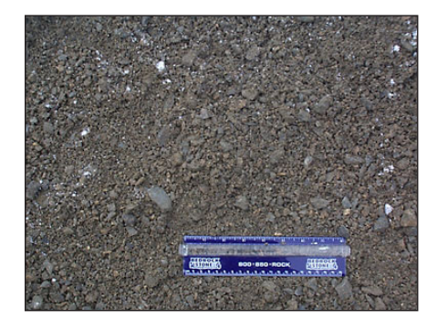
Figure 8. Densely graded aggregate for the surface layer.