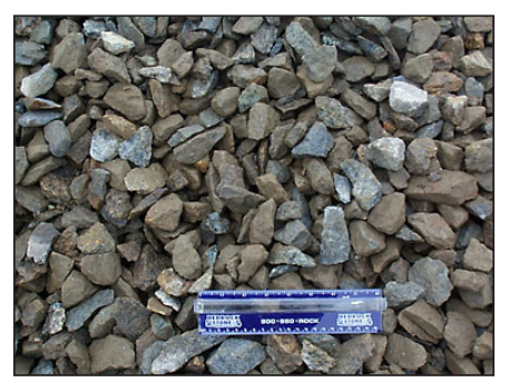
Figure 6. No. 4 crushed limestone.