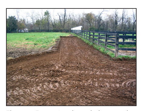
Figure 2. Excavation through the topsoil to stable soil beneath.