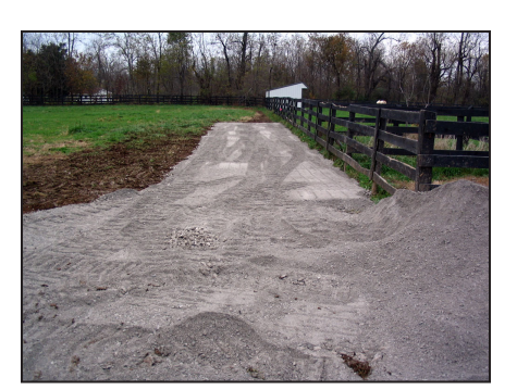
Figure 7. Surface layer of crushed stone.