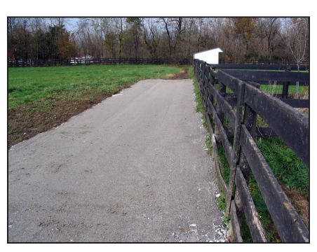
Figure 10. Compacted surface layer.