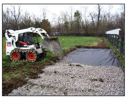
Figure 5. Base layer of crushed stone.