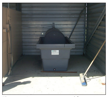
Figure 3. A separate area used for storing fuel (diesel) for the incinerator.

Collection of animal mortalities by rendering companies is available in most Kentucky counties. Pickup by rendering companies may be set up as a service through the fiscal court, conservation district, or Cooperative Extension Service, and cost-share may be provided to cover part of the fee. In some counties, the producer is responsible for arranging