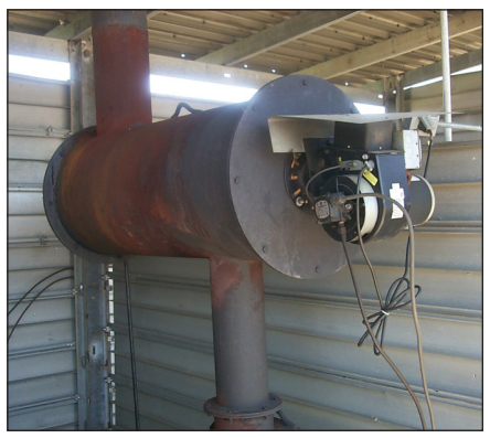
Figure 2. An afterburner used for a more efficient burn of exhaust gases.

Kentucky law requires that a buried animal be covered with at least 2 inches of quicklime. The purpose of applying quicklime is to discourage scavenging by predators, prevent odors, inhibit earthworms from bringing material to the soil surface, and destroy harmful bacteria. Quicklime raises the pH, making the local environment harsh for organisms to survive. When exposed to moisture, quicklime goes through a chemical process that generates heat, which also destroys microorganisms. As quicklime may destroy the harmful