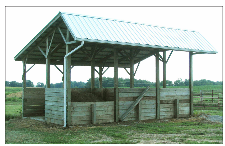
Figure 5. A three-bin shed with roof and doors.