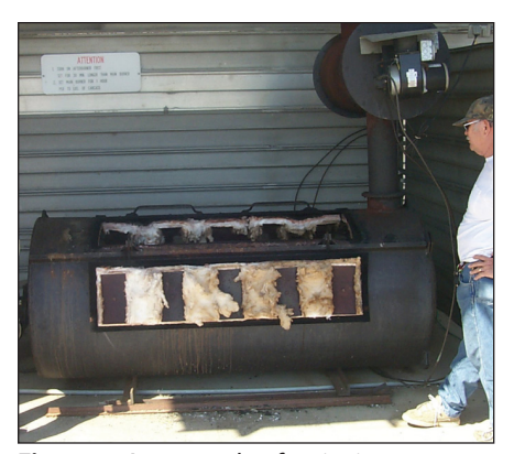
Figure 1. An example of an incinerator with an afterburner.

In the event of a pandemic (such as avian flu) that would create large numbers of carcasses to be destroyed, an emergency short-term protocol would be established. Under the protocol, and in accordance with 401 KAR 63:005, either open or air curtain burning is permissible when used for agricultural management practices. Incineration is another option, but construction of a large-scale incinerator on short notice may be a costly and uneconomical option.