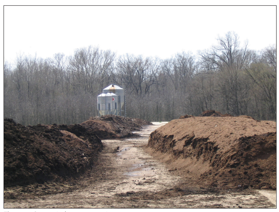
Figure 4. Open windrow composting system.

United States Department of Agriculture Natural Resources Conservation Service, Ohio. http://www.oh.nrcs.usda. gov/. Accessed August 22, 2007.