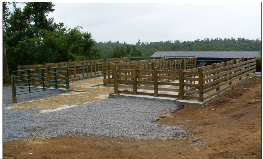
Figure 3. The heavy use area pad at the entrance of the structure provides a solid, stable surface that prevents cattle and equipment from creating mud.

Manure from the area should be collected and stored until it can be land applied to a crop or forage to effectively utilize the nutrients. A nutrient management plan (NMP) should be developed to calculate land application rates based on soil test results, realistic crop yields, and the concentration and amount of nutrients in the manure. The main goal of the NMP should be to protect local surface and groundwater quality. A rotational grazing structure for winter feeding can help accomplish that goal, along with improving production and preserving pasture quality.