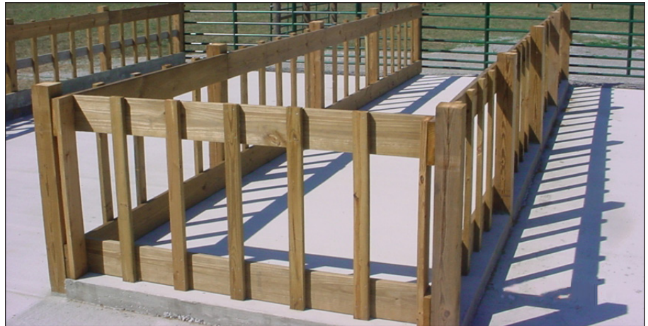
Figure 1. This winter feeding structure protects pastures, reduces labor, and decreases costs.

Production losses can occur if wintering cattle are haphazardly managed. When cattle are closely confined, especially in the winter, manure and wasted hay can accumulate. The manure con-