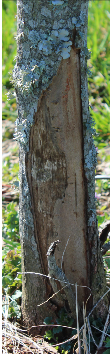
Figure 9. Mechanical damage caused by mowers and string trimmers are common causes of trunk damage.