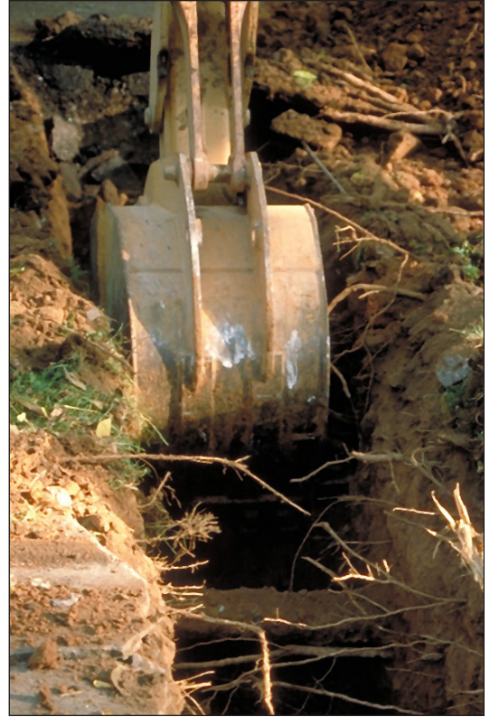
Figure 11. Damage to roots leads to reduced water uptake and exposes roots to invasive pathogens and insects.