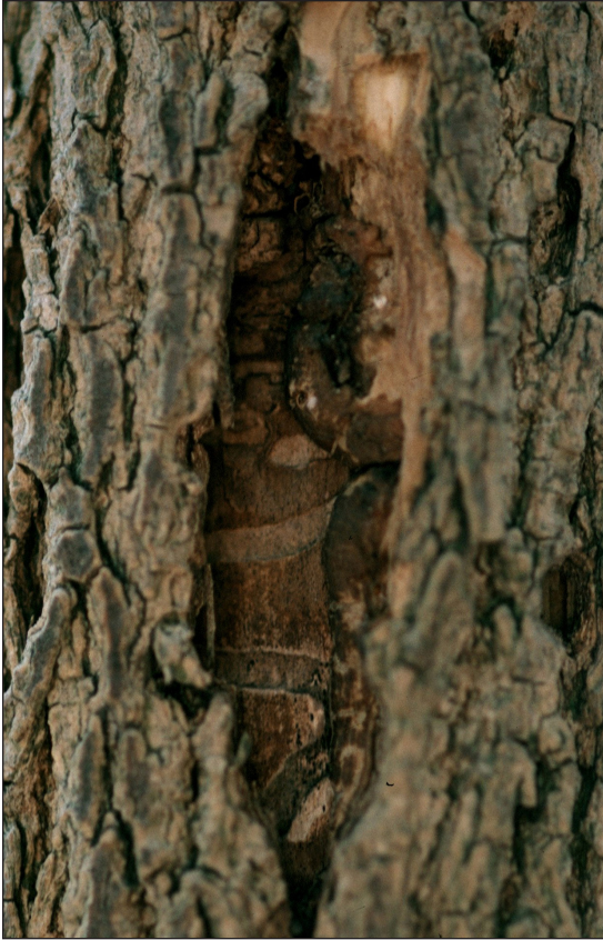
Figure 5. Boring insects cause branch dieback, but they may be difficult to detect without removing bark.