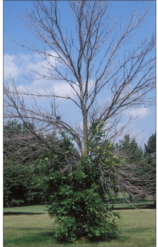
Figure 4. Severely declining or dying trees may re-sprout from roots, even though primary trunk is dead.