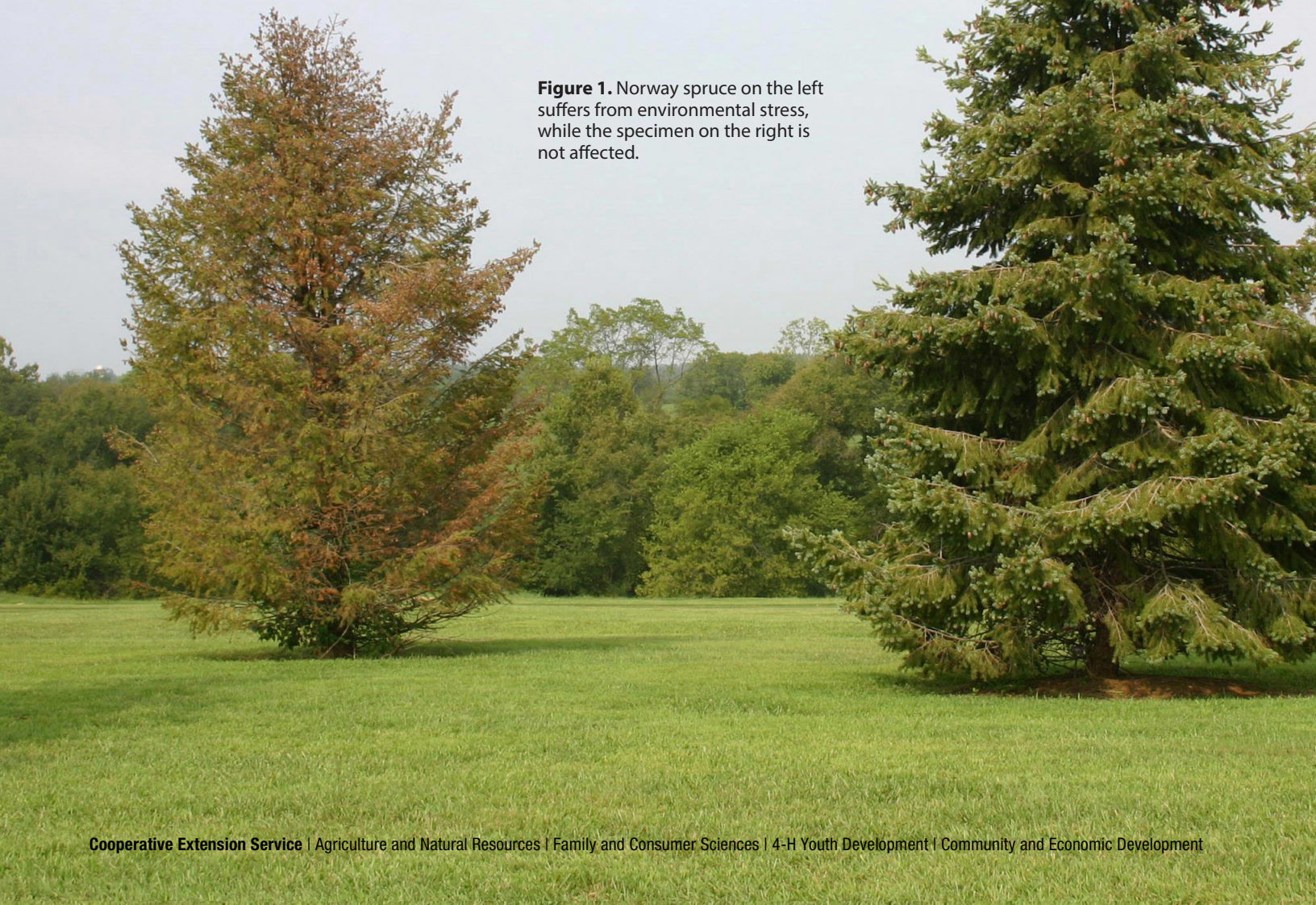
Figure 1. Norway spruce on the left suffers from environmental stress, while the specimen on the right is not affected.

Some of the most common plant stresses are addressed in this publication. A wider range of possible causes of plant stress and decline should be considered during evaluation of woody plant material.