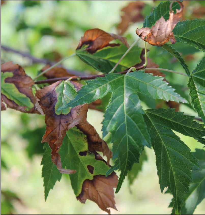
Figure 3. Scorching of leaf margins is often caused by restricted water uptake (e.g. drought, root damage, cankers, etc.).