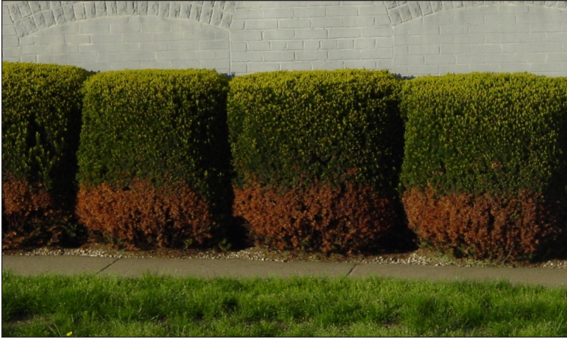
Figure 15. De-icing salts cause plants to freeze more easily; these salts move into plant beds via piled snow, and by drift or splash.

those of weed-killers absorbed by roots, but may also include leaf spots and leaf “burn.” Refer to Weed Control for Kentucky Home Lawns (AGR-208) for more information on herbicide selection.