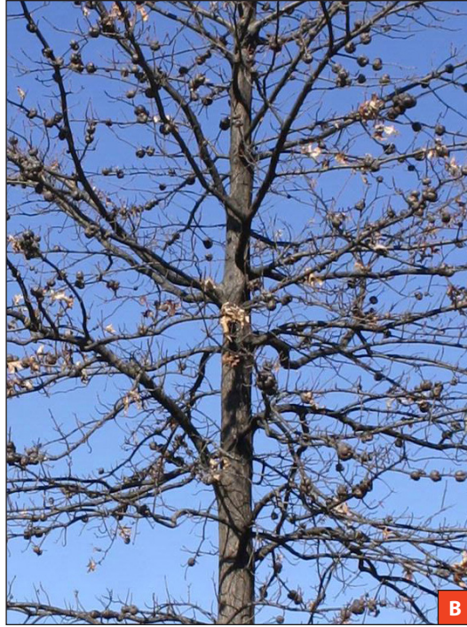
Figure 13. Horned oak galls (a) can induce stress and, in large numbers, cause dieback (b).

are simply aesthetic issues; however, wasp-induced horned oak gall (Figure 13) and gouty oak gall cause branch dieback.