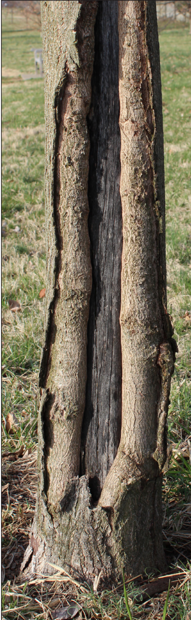
Figure 8. Sunscald often occurs on southern or southwestern sides of tree trunks during winter and early spring.