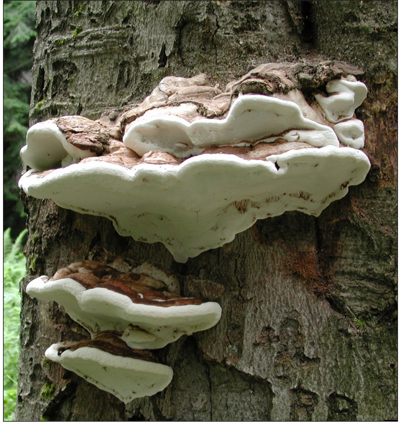
Figure 6. Mushrooms and conks indicate colonization and decay by wood-rotting fungi.