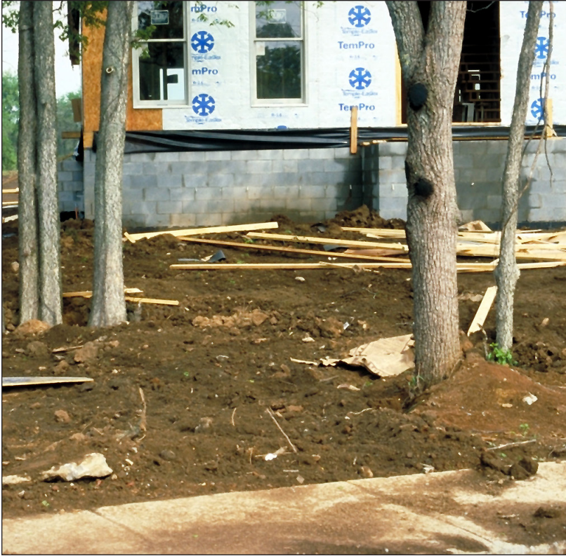
Figure 10. Grade changes from construction projects result in reduced soil-air exchange.