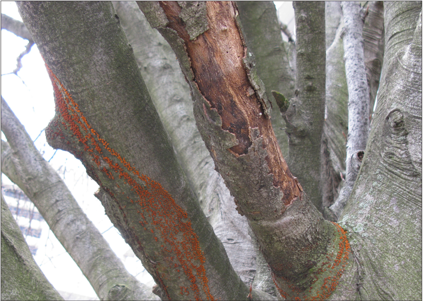
Figure 12. Cankers, such as this nectria canker on beech, girdle branches and restrict transport of water and nutrients.