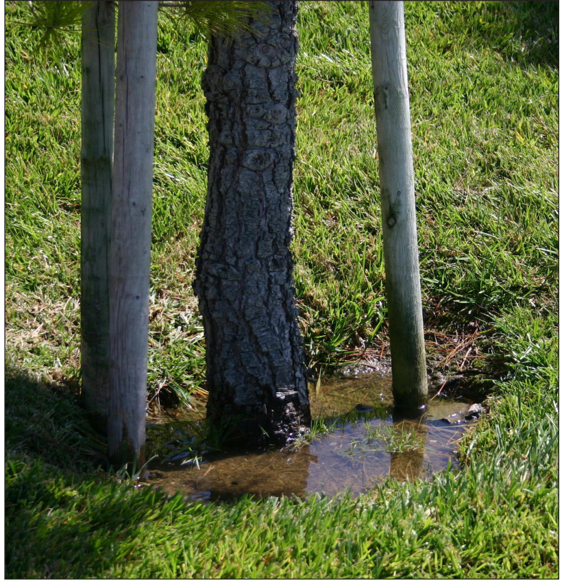
Figure 7. Proper planting depth and good soil drainage prevent puddling and “wet feet.”

Low soil fertility leads to nutrient deficiency in plants. Kentucky soils are rarely deficient in nutrients required by woody trees and shrubs. However, a soil test is required to determine whether fertilization is required. Nursery and container-grown plants are more prone to nutrient deficiencies and should be monitored regularly.