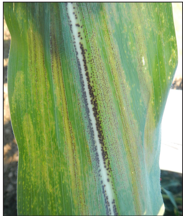
FIGURE 1. DARK BROWN OR PURPLE LESIONS IN THE MID-RIBS OF LEAVES IS A COMMON SYMPTOM OF PHYSODERMA BROWN SPOT.

Physoderma brown spot is caused by the fungus Physoderma maydis . This fungus produces survival structures (sporangia) that overwinter in corn residue and soil. Sporangia are dispersed by wind or water to young corn plants in spring. Infection requires sunlight, warm temperatures (75° to 85°F), and water. The fungus usually initiates infections within the