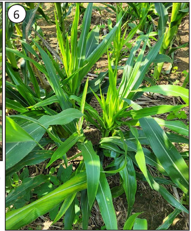
FIGURE 3. SHORTENED INTERNODES ON THE STALK OF A CORN PLANT AFFECTED BY CRAZY TOP. FIGURE 4. TILLERING (LEFT) AND YELLOWING (RIGHT) OF PLANTS AFFECTED BY CRAZY TOP. FIGURE 5. STUNTED PLANT WITH SHORTENED INTERNODES AND YELLOW STRIPING ON LEAVES CAUSED BY CRAZY TOP. FIGURE 6. TILLERING AND BUSHY APPEARANCE OF PLANTS CAUSED BY CRAZY TOP