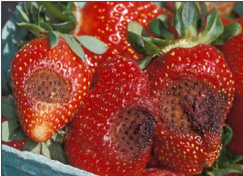
FIGURE 1. ANTHRACNOSE FRUIT ROT CAUSES DARK, SUNKEN SPOTS.

Small, dark lesions develop on stolons and petioles and gradually become black, dry, and sunken. Girdling lesions (FIGURE 5) on stolons result in the death of unrooted daughter plants; leaves die when their petioles are girdled. Small, round, black-to-gray spots may appear on expanding leaflets even before petiole or stolon symptoms are noticed.