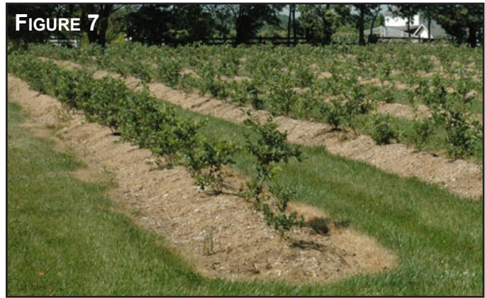
FIGURE 6. LOW-LYING AREAS ARE OFTEN THE MOST POORLY DRAINED, AND THEREFORE, ARE USUALLY THE FIRST TO BECOME AFFECTED BY DISEASE. FIGURE 7. IN ORDER TO INSURE SUFFICIENT DRAINAGE, BLUEBERRY SHOULD BE PLANTED ON BEDS RAISED AT LEAST 12 INCHES HIGH.