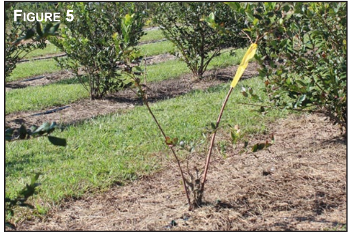
FIGURE 4. ABOVEGROUND SYMPTOMS BEGIN WITH LEAF YELLOWING OR REDDENING. THIS IS THE RESULT OF REDUCED WATER AND NUTRIENT UPTAKE CAUSED BY ROOT LOSS. FIGURE 5. DEFOLIATION AND BRANCH DIEBACK ARE SYMPTOMS OF ADVANCED DISEASE DEVELOPMENT.

symptoms include defoliation, branch dieback (FIGURE 5), and plant death. Often plants in lowest lying areas are first to be affected (FIGURE 6). Growers may look for water-loving weeds such as sedges as indicators of poor drainage.