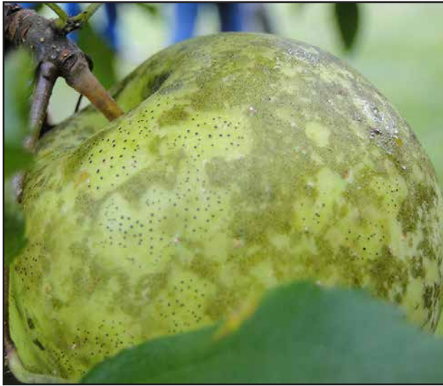
FIGURE 2. SOOTY BLOTCHES AND SPECKS ARE OFTEN MORE OBVIOUS ON LIGHT-COLORED FRUIT, SUCH AS 'GOLDEN DELICIOUS' SHOWN HERE.

in groups of just a few to over a hundred. Multiple clusters may be present on a single fruit. Blotches and specks often appear together on the same fruit. SBFS occurs in the waxy cuticle of apple fruit and does not cause decay. However, the fungi can disrupt this protective waxy layer resulting in moisture loss (desiccation), shortening storage life.