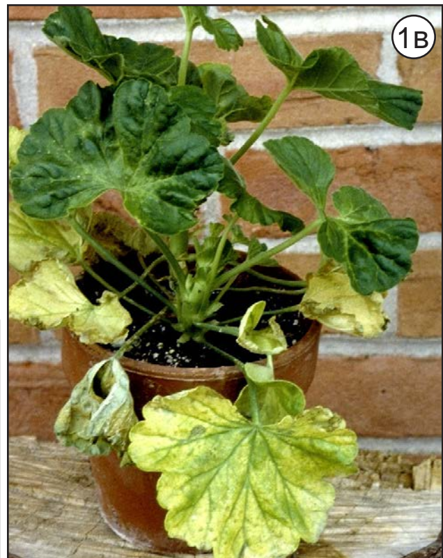
FIGURE 1. SHOWN HERE ON GERANIUM, (A) EDEMA RESULTS IN THE FORMATION OF CORKY AREAS ON LEAF UNDERSIDES. (B) WHEN SEVERELY AFFECTED, LEAVES CAN TURN YELLOW AND DIE.