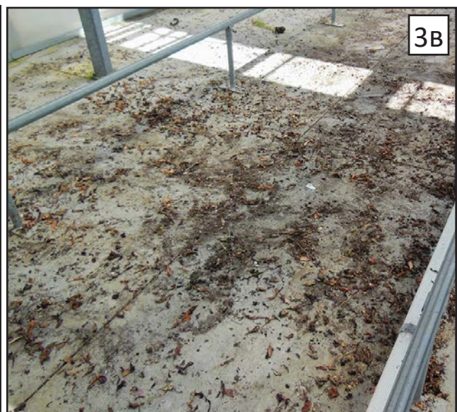
FIGURE 3. CLEAN UP SOIL AND PLANT DEBRIS FROM FLOORS, INCLUDING (A) WALKWAYS AND (B) UNDER BENCHES, IN ORDER TO ELIMINATE SOURCES OF DISEASE PATHOGENS.