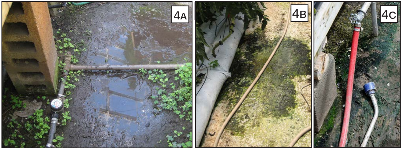
FIGURE 4. (A) WEEDS, SOIL, AND RUNOFF CAN ALL SERVE AS SOURCES FOR PATHOGEN SPREAD AND/OR OVERWINTERING. GREENHOUSE FLOORS SHOULD REMAIN CLEAN AND DRY; BARE SOIL SHOULD BE COVERED WITH GRAVEL OR CONCRETE. (B) HOSES AND (C) SPRAYER NOZZLES SHOULD NOT BE DRAGGED ALONG THE GROUND WHERE THEY CAN PICK UP PATHOGENS.