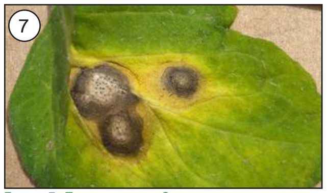
FIGURE 7. THE CENTERS OF SEPTORIA LEAF SPOT LESIONS BECOME DOTTED WITH FUNGAL FRUITING BODIES (PYCNIDIA).

Septoria leaf spot first develops on lower foliage and progresses up the plant. It can occur at any stage of plant maturity, but commonly develops after the first fruit set. Lesions can appear on stems and leaflets. The circular to semi-circular spots have tan to gray centers with dark brown margins (FIGURE 2); centers become dotted with black spore-producing structures (pycnidia) (FIGURE 7). Spots are often surrounded by a yellow halo and individually remain smaller than 1/3 inch in diameter. However, Septoria lesions often merge, progressing to a blight that kills leaves and causes plants to defoliate. Infections on fruit are exceedingly rare.