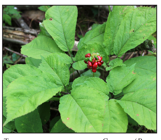
The harvest and sale of Ginseng ( Panax quinquefolius ) is regulated by state law.

All ginseng harvested in the state can only be sold through dealers who have been licensed by the Commonwealth of Kentucky, regardless of