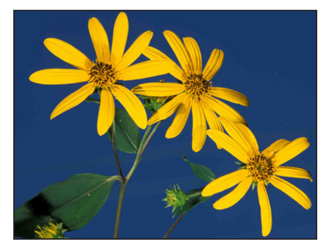
Sunflower (Helianthus eggertii) is KENTUCKY'S THREATENED AND ENDANGERED SPECIES LIST.

owned property is not without its legal restrictions. Violations to any of these local, state, and/ or federal laws can carry hefty fines of thousands of dollars, as